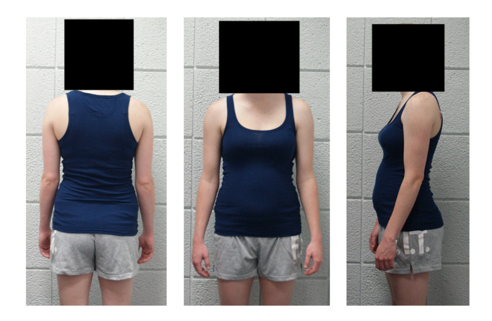
Figure 1. Sample stimulus photo.

During the third laboratory session of the first cycle (typically within the luteal phase), each woman was photographed in standardized dress comprised of grey gym shorts and a blue tank top shirt. Photos were taken with a digital camera at a standard distance in a windowless room with artificial lighting. For each woman, photos were taken from front-facing, back-facing, and side-facing perspectives; these three photos were placed together onto a single stimulus array for each woman, with an opaque mask blocking the head area in each photo. An example stimulus array appears in Fig. 1.