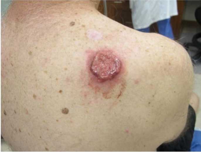
Figure 1. The right upper back shows a 4.0cm ulcerated plaque with heaped edges and granulation tissue at the base.

scalp and neck with central ulceration and overlying crust. Two biopsies were obtained from an ulcerated plaque on the back, one for tissue culture and one for histological examination.