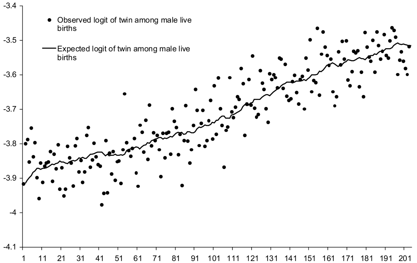
Figure 3. Observed and expected logits of a twin among male live births in California for 204 months beginning January, 1989 and ending December, 2005.