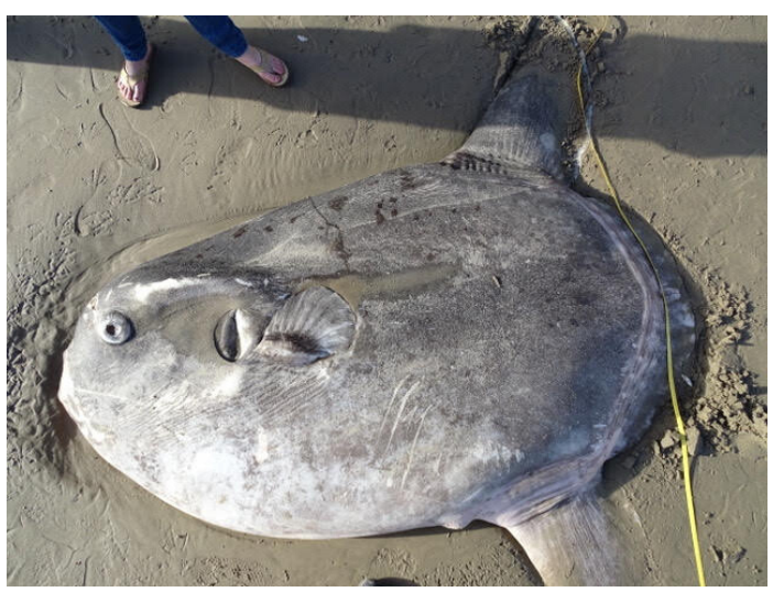
A Hoodwinker Sunfish, Mola tecta , was discovered washed ashore.