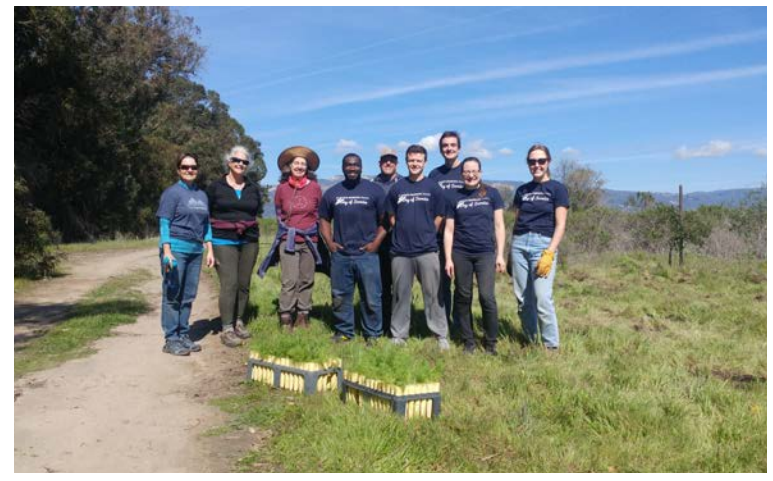
UCSB Alumni Day of Service at the reserve.

In addition to all the planting we were able to do; we tackled a few other big stewardship projects at the reserve this year. As part of an effort to improve our restoration, we launched a soils mapping project. With the help of our Coastal Fund intern, Jae Rivera, we collected soil samples from over 50 locations around the reserve in order to map the different soil types that occur here. We also made a big push this year to reduce the amount of invasive Cape Ivy on the reserve. Several volunteer groups helped us with hand removal of Cape Ivy, including the UCSB Kite Boarding Club and the Latino Business Organization.