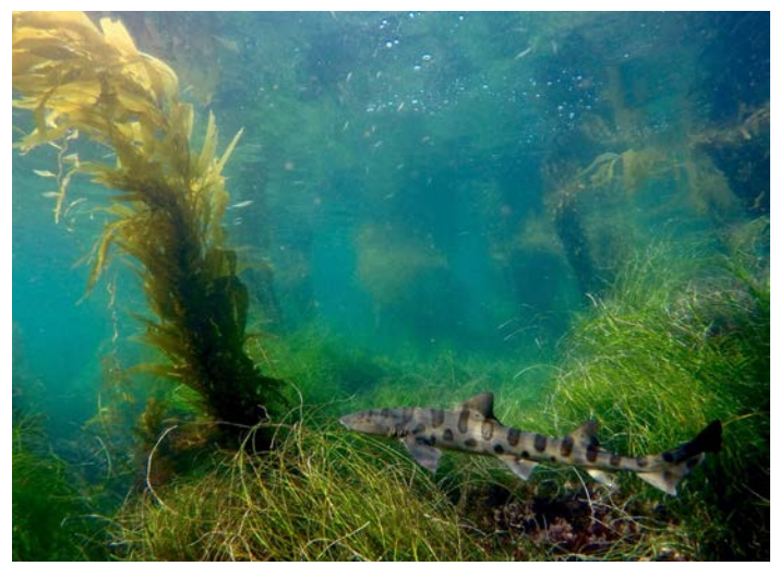
Undergraduate research on leopard shark diet was conducted at COPR.