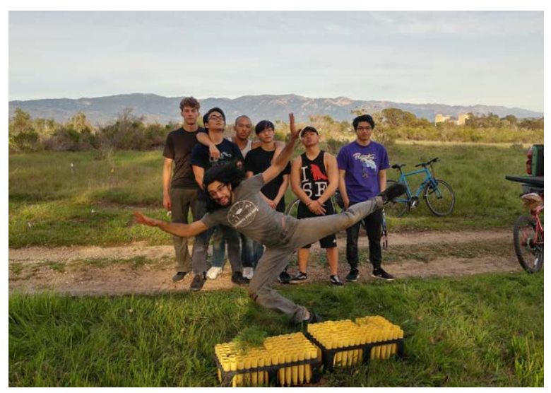
Breakdancers from UCSB Breakin' volunteered to plant native plants.

This year was a busy year for the stewardship program at COPR. We received almost 25 inches of rain, which is well above average. The increase in rainfall, meant that it was a great year for planting. We were able to plant over 2,000 plants as part of our efforts to restore native grassland and coastal scrub communities on the reserve. We received a tremendous amount of help with planting from several student and community groups, including the Environmental Affairs Board, UCSB ROTC, the Community Affairs Board, UCSB Wildlife Society, UCSB Breakin', and REI.