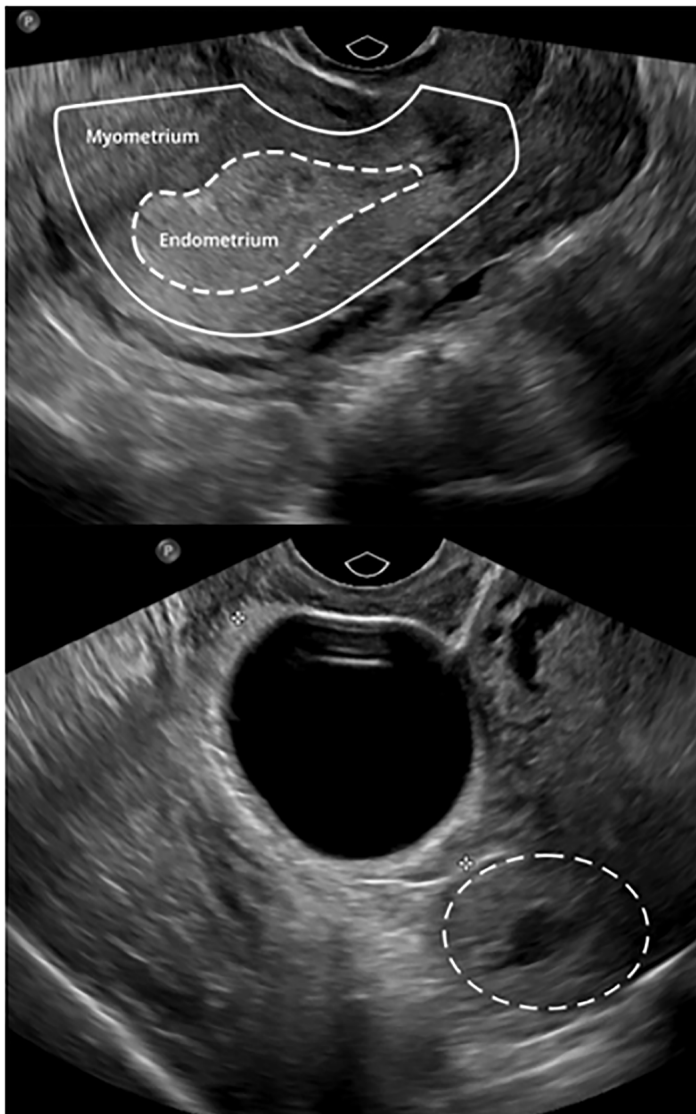
Image 1. Initial transvaginal ultrasound six weeks prior to presentation, revealing an empty uterus (top) and a “cystic area” measuring 2.3 x 2.5 x 3.2 centimeters in the left cornual region (bottom, dashed circle).

quantitative beta-human chorionic gonadotropin ( \beta hCG) of over 16,000 milli-international units per milliliter (mIU/mL) (normal hCG range: <3 mIU/mL), her levels fell to 1700 mIU/mL two weeks prior to arrival.