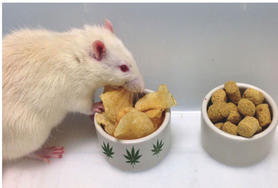
FIG. 2. Fatty food intake is driven by gut–brain endocannabinoid signaling. Tasting dietary fat increases endocannabinoid levels within the rat jejunum. 42 Inhibiting local endocannabinoid signaling at jejunal CB 1 Rs reduces fat intake and preferences for unsaturated dietary fats. 42,53 Here, a rat prefers to eat fat-rich potato chips rather than a standard laboratory chow, which contains far lower quantities of dietary fat than chips. Thus, it is proposed for illustrative purposes that this rat’s preference for the fat-rich food is driven by an enhancement of gut–brain endocannabinoid signaling (i.e., the body’s natural “cannabis-like molecules”) that is triggered by tasting the fat contained in the chips.

production of jejunal 2-AG during fasting, an analysis of the role for cholinergic neurotransmission carried by the vagus nerve was evaluated. Studies conducted in the 1960s and 1970s found that (i) refeeding after a fast and (ii) sham feeding of a nutritional liquid diet by rats were blocked by the peripherally restricted general mAChR antagonist, atropine methyl nitrate, suggesting that cholinergic signaling in the periphery and an unknown downstream peripheral signaling mechanism are critical for maintaining feeding. 57,58 Similar to results for sham-feeding corn oil, 42 subdiaphragmatic vagotomy completely blocked fasting-induced rises in levels of 2-AG in the jejunum. 43 Importantly, this blockade was mimicked by systemic administration of the general mAChR antagonist, atropine, or local intraduodenal administration of the selective m 3 mAChR antagonist, DAU5884. Together, the results provide novel evidence suggesting that cholinergic neurotransmission—possibly carried by the efferent vagus nerve—activates jejunal m 3 mAChRs, which, in turn,