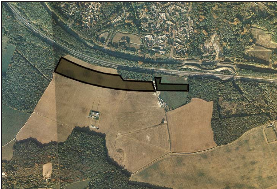
Figure 2. Location of new woodland site.

The location of the new woodland site is shown in figure 2.