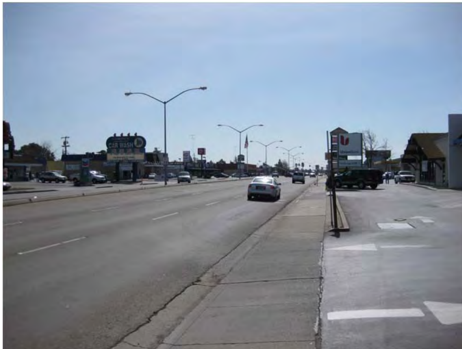
Figure 8. Pacific Ave - Existing Conditions