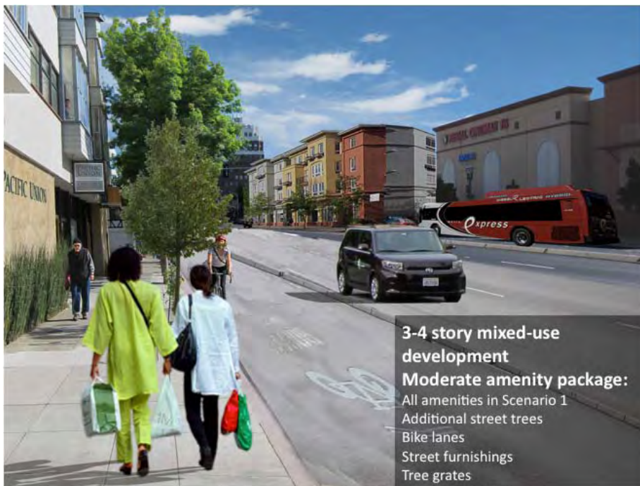
Figure 5. Miner Ave - Scenario 2