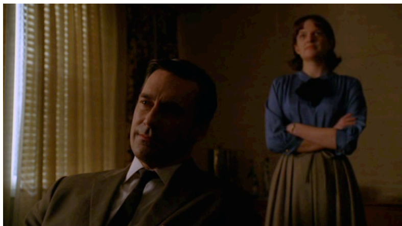
Stills from "Love Among the Ruins" (3.2)