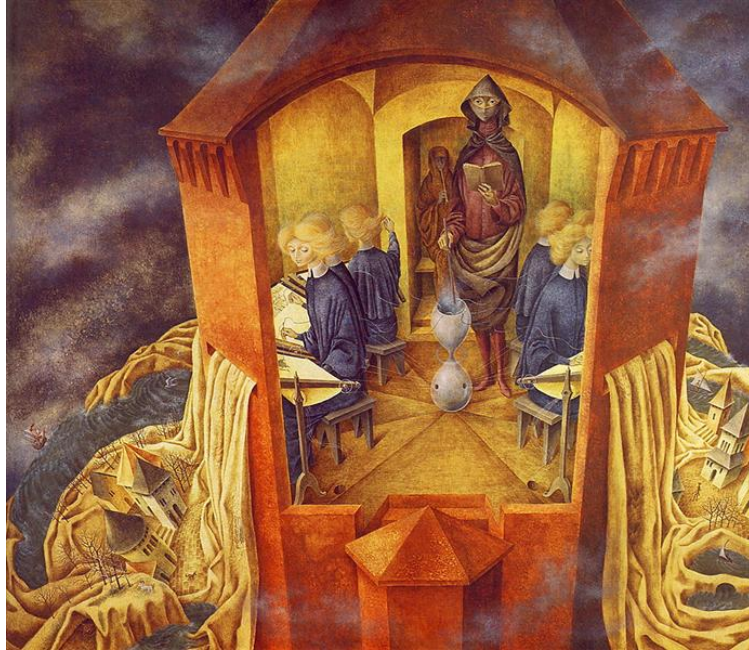
Remedios Varo, Embroidering Earth's Mantle (1961). 27