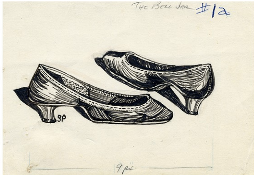
Plath's Study of Shoes (1956) 3