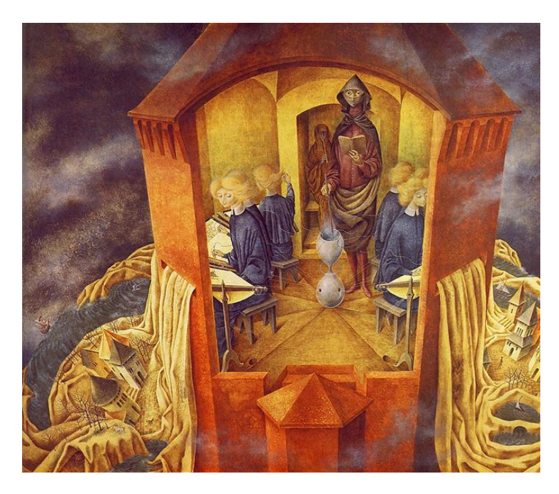
Remedios Varo, Embroidering Earth's Mantle (1961).27