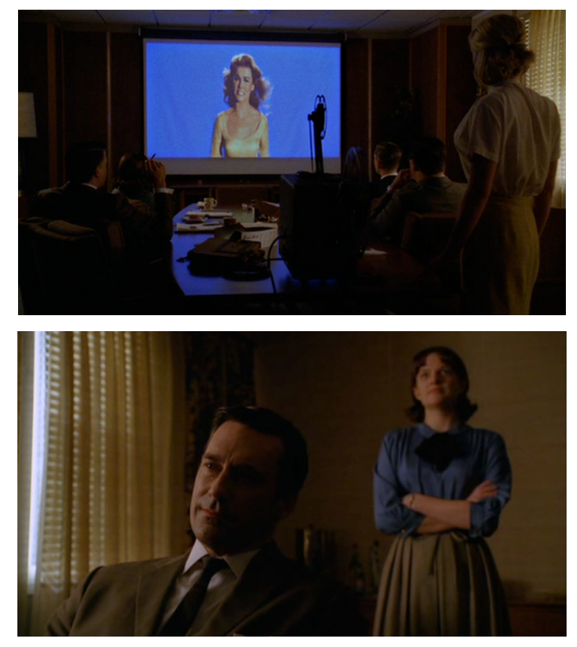
Stills from "Love Among the Ruins" (3.2)