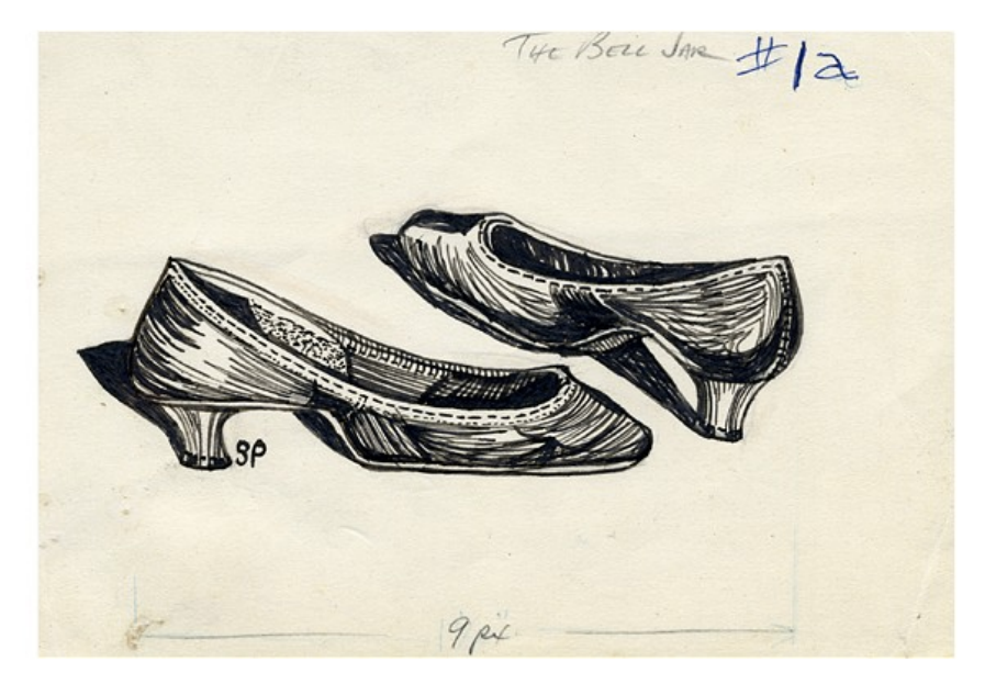
Plath's Study of Shoes (1956)3