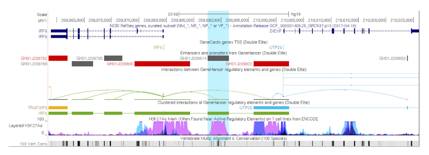
Figure 1. The GeneHancer track set and the interaction track format with hills instead of the default valleys. The GeneHancer track relates enhancer and promoters to their interactions with nearby genes. In this display, a highlighted GH01J209814 enhancer is associated with the gene IRF6 (interferon regulatory factor 6) located about 10 kb upstream.

option may be useful for navigating clinical or proprietary data or using the Browser behind a restrictive firewall.