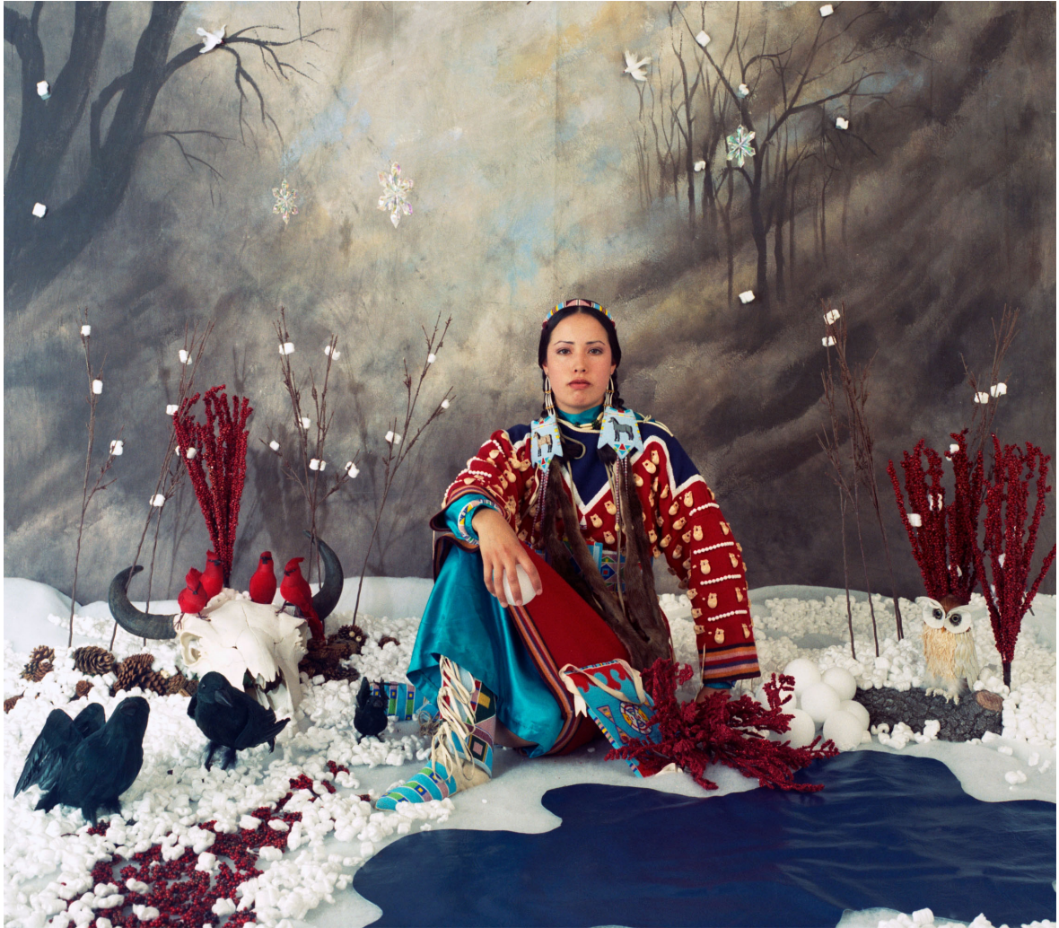
Figure 1.3 Wendy Red Star, Winter from the series Four Seasons , 2006, Archival pigment print on Museo silver rag mounted on Dibond, 35.5 by 37 inches, Nerman Museum of Contemporary Art.