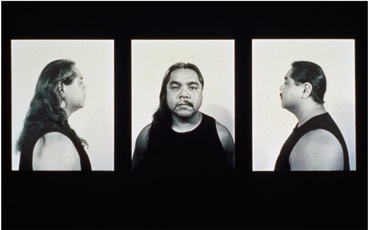
Figure 1.9 James Luna, Half Indian/ Half Mexican , 1991, inkjet print, 30 1/16 in x 72 3/16 in, Denver Art Museum.