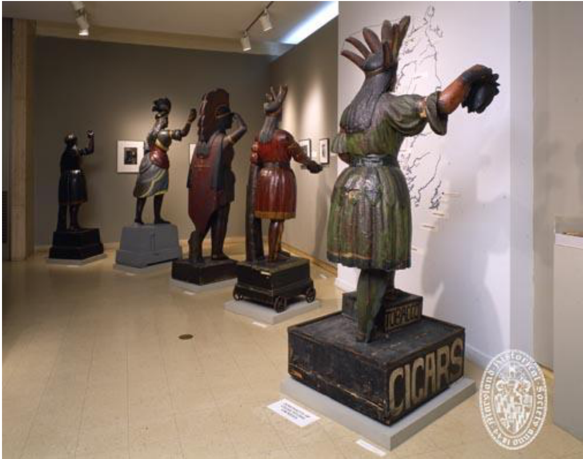
Figure 1.1 Fred Wilson, Mining the Museum , 1992-93, installation, Maryland Historical Society.