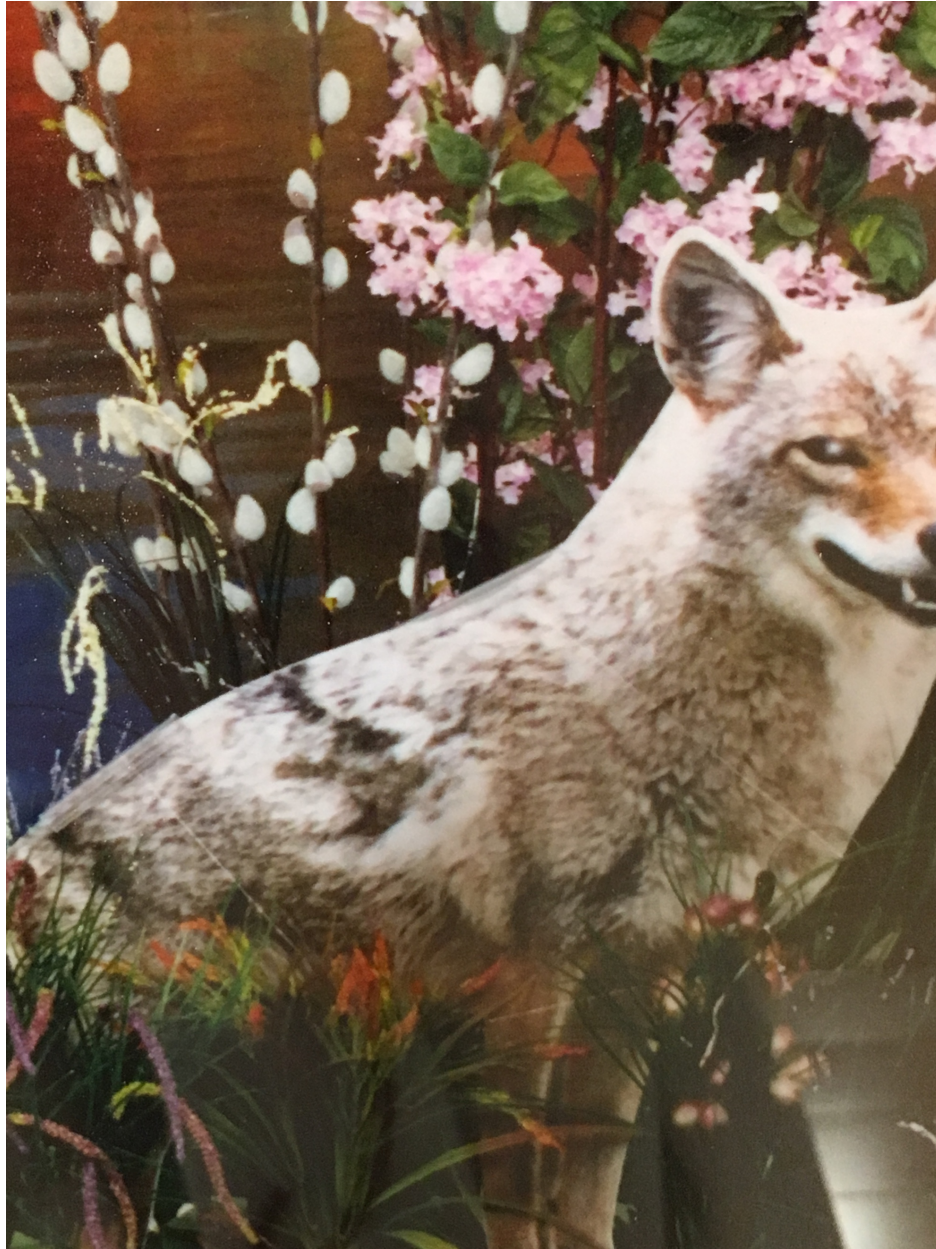
Figure 3.4 Wendy Red Star, Close up of Spring from Four Seasons , 2006, Archival pigment print on Museo silver rag mounted on Dibond, 35.5 by 37 inches, Nerman Museum of Contemporary Art.