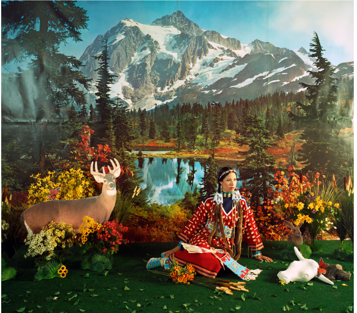
Figure 1.5 Wendy Red Star, Indian Summer from the series Four Seasons , 2006, Archival pigment print on Museo silver rag mounted on Dibond, 35.5 by 37 inches, Nerman Museum of Contemporary Art.