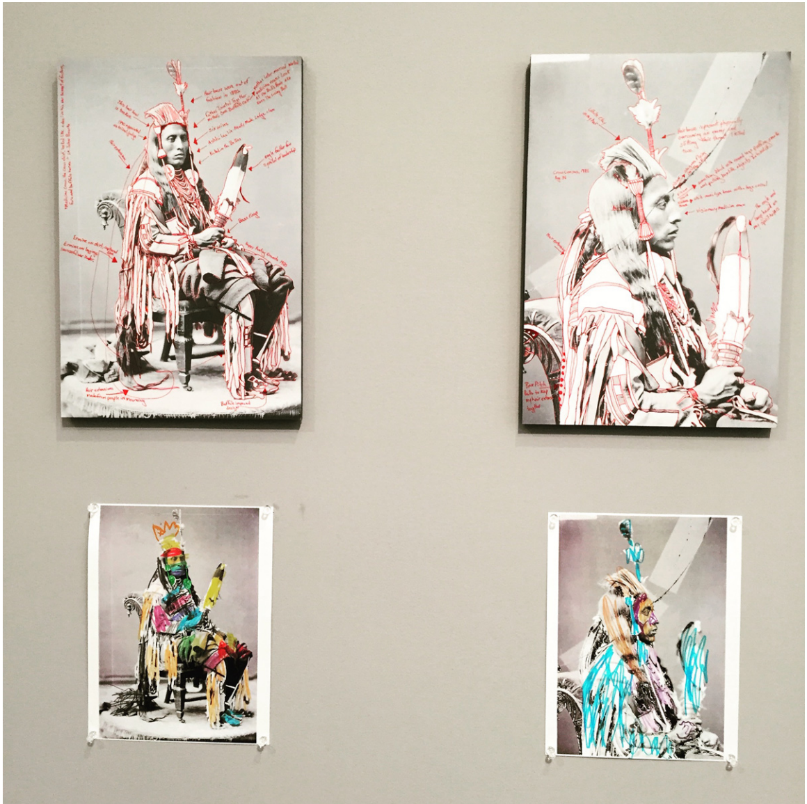
Figure 1.11 Wendy Red Star, Peelatchiwaaxpaash Medicine Crow (Raven) & the 1880 Crow Peace Delegations , 2014, Artist-manipulated digitally reproduced photographs by C.M. (Charles Milton) Bell, various dimensions, Portland Art Museum.