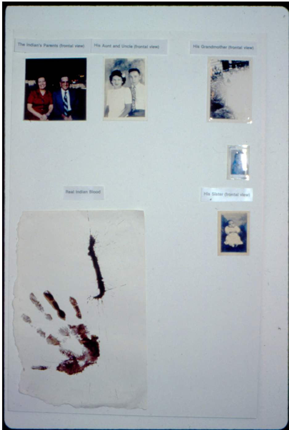
Figure 1.6 Jimmie Durham, The Real Indian Family from On Loan from the Museum of the American Indian , mixed media, variable dimensions, 1985, Collection Roger Pailhas.