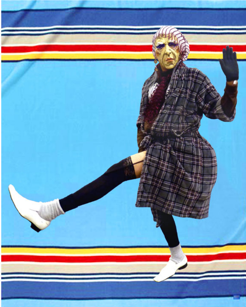
Figure 3.1 Wendy Red Star, Crow Clowns , 2014.