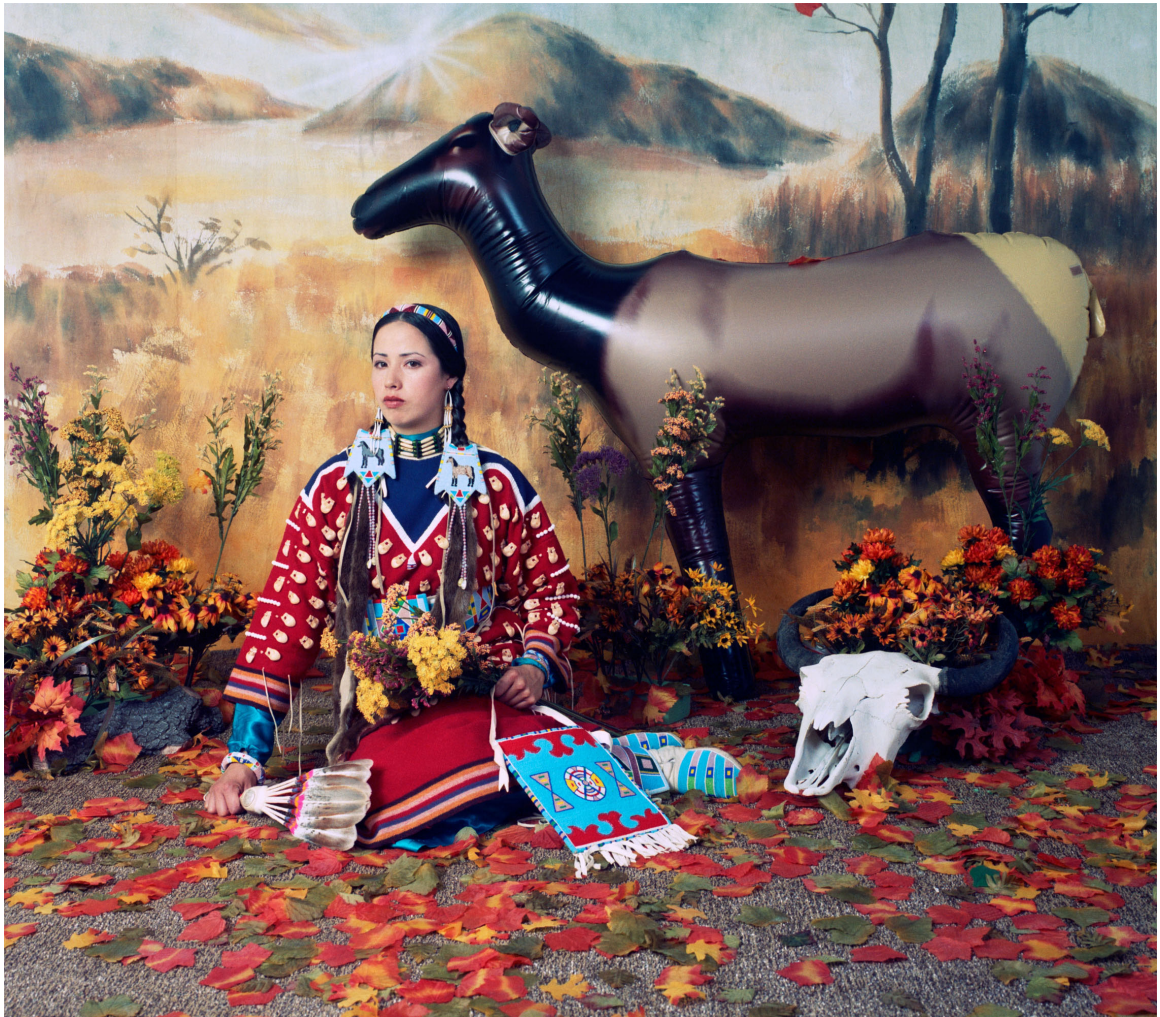
Figure 1.2 Wendy Red Star, Fall from the series Four Seasons , 2006, Archival pigment print on Museo silver rag mounted on Dibond, 35.5 by 37 inches, Nerman Museum of Contemporary Art.