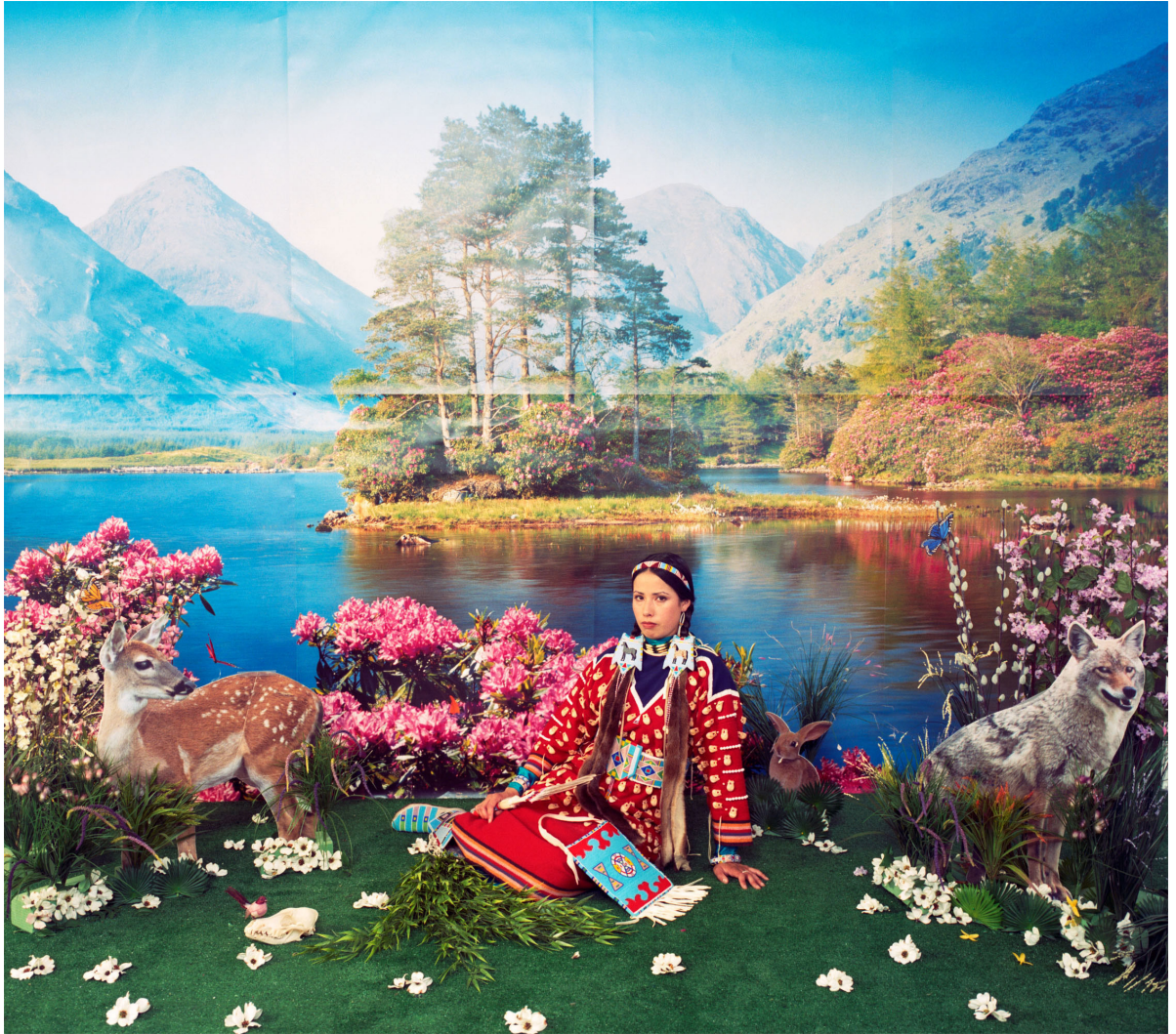
Figure 1.4 Wendy Red Star, Spring from the series Four Seasons , 2006, Archival pigment print on Museo silver rag mounted on Dibond, 35.5 by 37 inches, Nerman Museum of Contemporary Art.