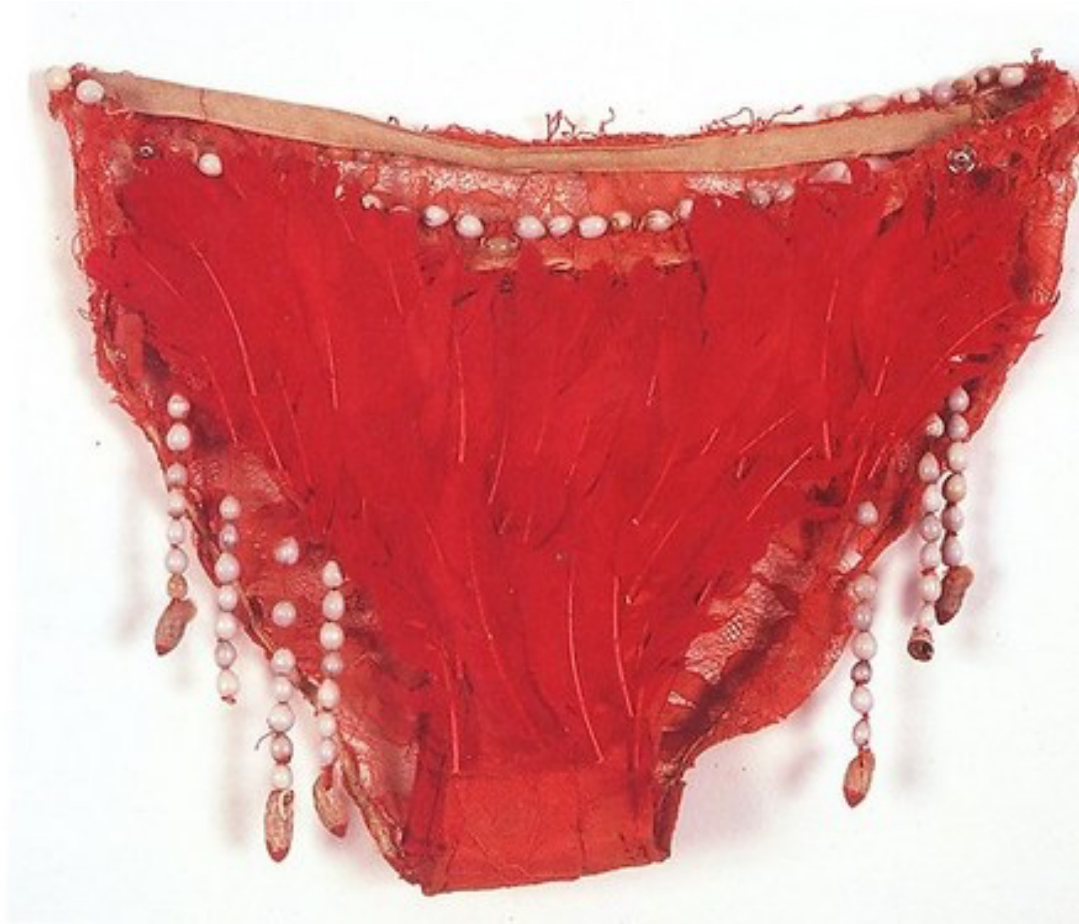
Figure 1.7 Jimmie Durham, Pocahontas' Underwear from On Loan from the Museum of the American Indian , 1985, feathers, beads, fabric, fasteners, 31 x 25 cm, Private Collection.