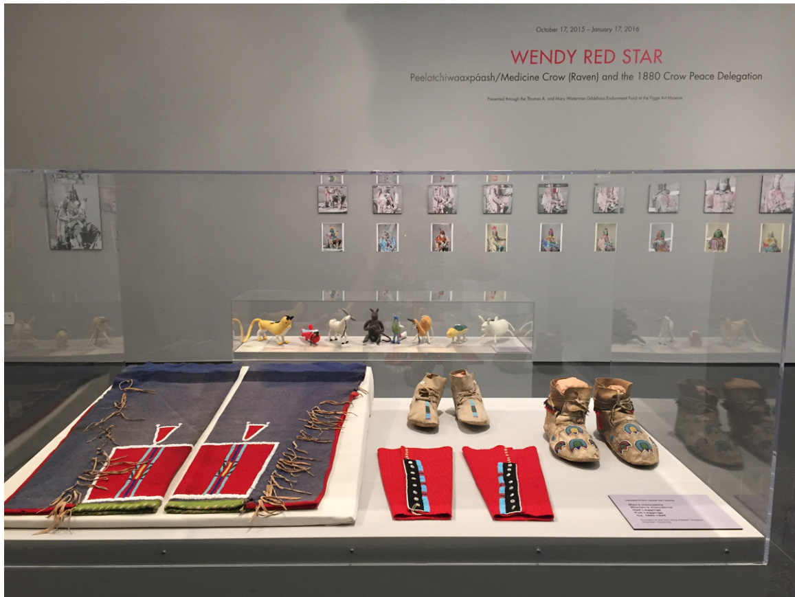
Figure 1.10 Wendy Red Star, Peelatchiwaaxpaash Medicine Crow (Raven) & the 1880 Crow Peace Delegations , 2014, mixed media, various dimensions, Portland Art Museum.