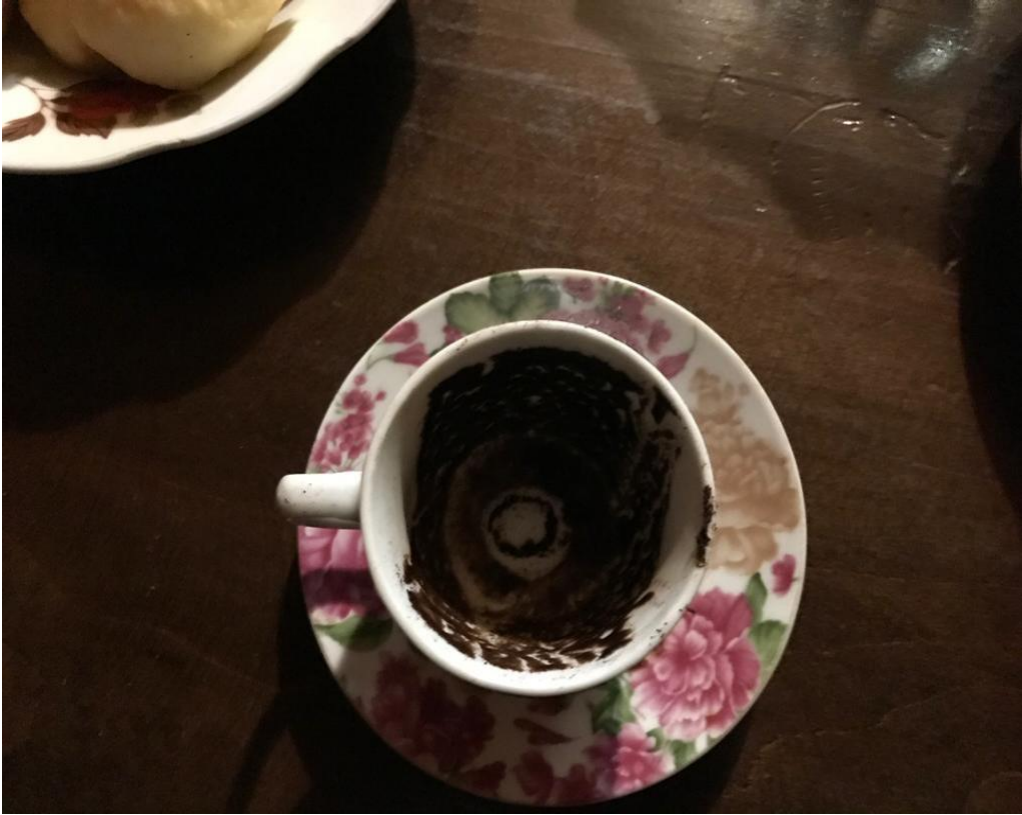
The cup of coffee that contains the prophecy of my future. November 22, 2018.