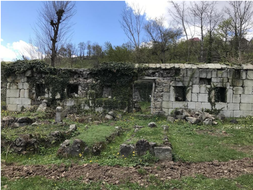
The Khulo Mosque Cemetery (April 2018)

Tucked behind these buildings, just past the mosque and a small apiary, lies a heap of stones that is barely noticeable from the main circle in front of the mosque. From a distance, the stones are visibly old and falling apart, and weeds have grown all around them. As one approaches, one can make out that the stones actually form an enclosure, a low wall, and that some of the stones in the ground in front of this low wall are actually gravestones—from up close, one can even make out Ottoman Turkish inscriptions on some of them. Once one passes the apiary and turns to face east, an entranceway appears in the stone enclosure. There is a wooden plank above the open entranceway, wedged in among the stones, that was presumably placed there to preserve the integrity of the structure.