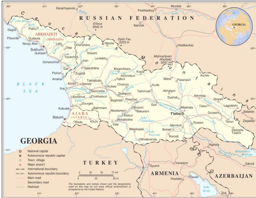
Map of Georgia

switching and translation are the norm, and define everyday life and survival. — frontiers/borders are multiple as well, inscribed in the land as well as on people, those who are folded into these multiple imperial times, inscribed on their names, their religion, their God, and their language.