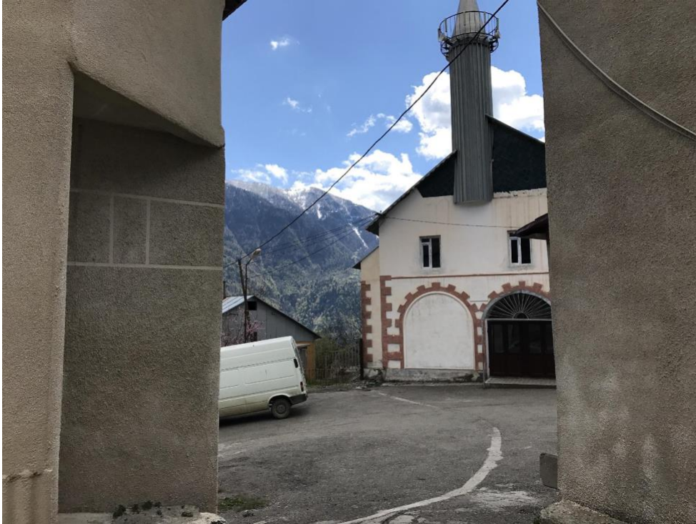
Khulo Mosque and courtyard, from the alley in between the main office and the boarding school, with Mount Argineti in the background (April 2018)