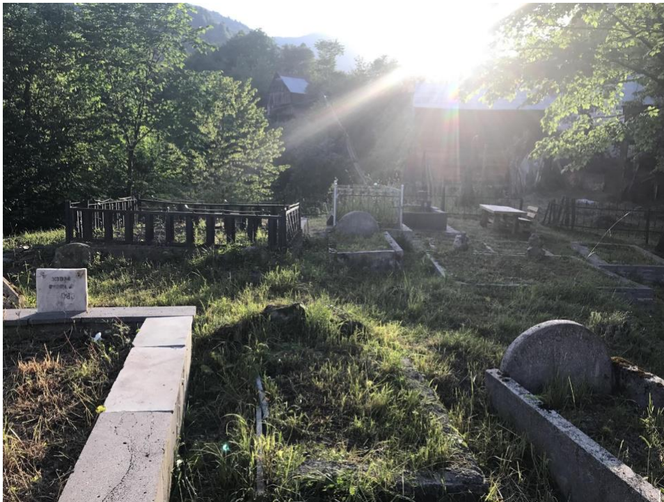
Salihoghli cemetery, II (June 2018)

These two graves were quite prominent, standing out not only for their size and shine, but also for each including a photographic image of the deceased—something very uncommon in villages in Khulo. These two largest graves were among several older, smaller graves that each had a small headstone in the shape of a semicircle about a foot high, on which was written in