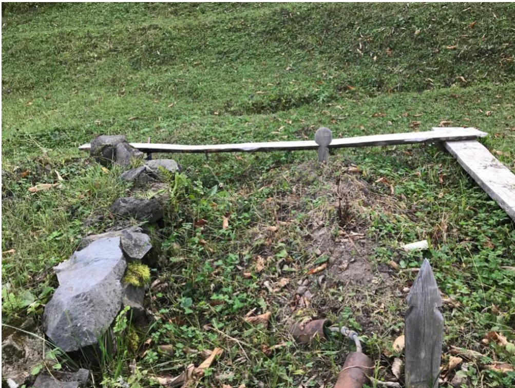
Ottoman-era graves on Lado Tavartkiladze’s land (October 2018)

While we were drinking and talking after coming back to their home, Lado’s mother came downhill along the path from Upper Dzirkvadzeebi where most of the pastureland is in the village, and since it was fall and Beshumi was snowed in, the cows were back in the village and returned to graze what was left of the grass here in the different clearings shared by Lado and Beto’s family line. One calf was being a bit stubborn and slipped away from the path to the cowshed. Lado and I caught up with it about 20 yards from the house, near a patch of grass that seemed a bit overgrown and abutted the fence that enclosed the vegetable garden. Lado grabbed a hold of the calf, and pointed out to me some rocks in the dirt below our feet. “You wanna see something really old?” he asked me. “These stones are old graves—my ancestors.” The stones were barely visible, hardly distinguishable from the dirt and grass and other small rocks they were embedded in. These two graves were flanked with two wooden boards, marking them off from the rest of the grassy slope. One of the graves was mostly broken rocks, while the other was mostly dirt, with two wooden Ottoman-style gravemarkers, one at the head and one at the foot of the grave. Lado himself wasn’t sure exactly who was buried here, just that they were his direct forebears who had lived on this land as well.