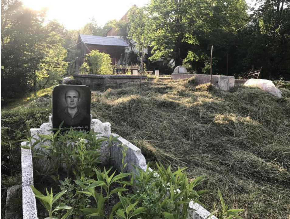
Salihoghli cemetery, I (June 2018)