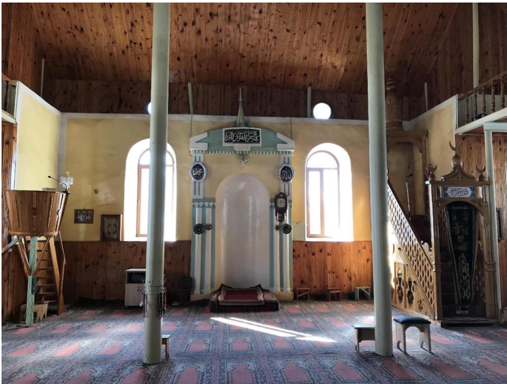
Interior of the Khulo Mosque (April 2018)