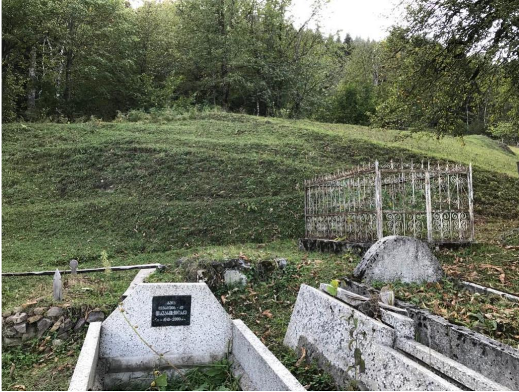
Ottoman-era graves among others on Lado Tavartkiladze's land (October 2018)

This small plot of graves, like many of the family cemeteries in Khulo's villages, exhibited at least four different styles of graves all together. Each style of grave, each form of materializing memory, anchoring the corpse in the land through a specific semiotic regime of language and gravemarking, is a trace of the intersection between the here and the there , the distinct points in historical time that are cut by an intervention of the divine through which a soul departs for the place of there .