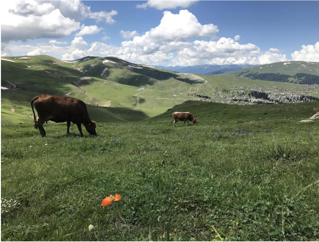
Cows grazing on Beshumi's pastures, with some of Beshumi's neighborhoods visible in the distance (June 2018)

make special dishes only possible with the fresh cheese, milk, and cream produced by the cows grazing all summer on the Beshumi pastures.