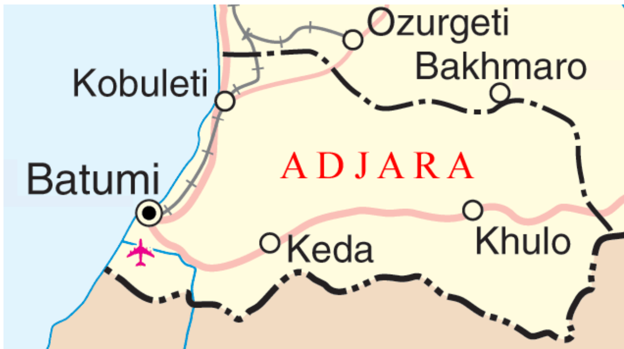
Map of Adjara, indicating the locations of my two field sites, Batumi and Khulo.

How does this relation between archive and history become embodied as tradition in the present through social practices such as hospitality, domestic labor, religious education, translation, and desire?