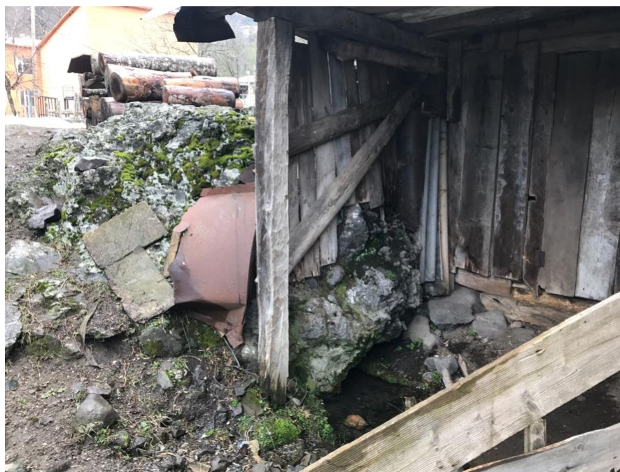
Dzirkvadzeebi’s eponymous stone, now forming part of the base of a wooden storage shed. The stream that flows out from under it divides the land between neighbors all the way down to the valley below. (March 2018).