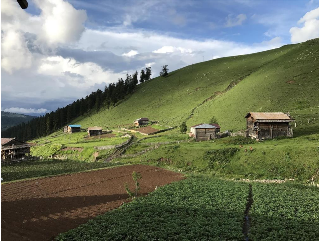
Some houses and potato fields of Nachadrevi (June 2018)

Particularly striking is a spring about a two hour walk into the woods called Pasha Puari —from Meskhetian Turkish paşa puvari —meaning “pasha spring.” 29 Like yaslughi , which we encountered in the previous chapter, this lexical trace in the place name of a spring indexes a past Meskhetian-Adjarian shared linguistic world.