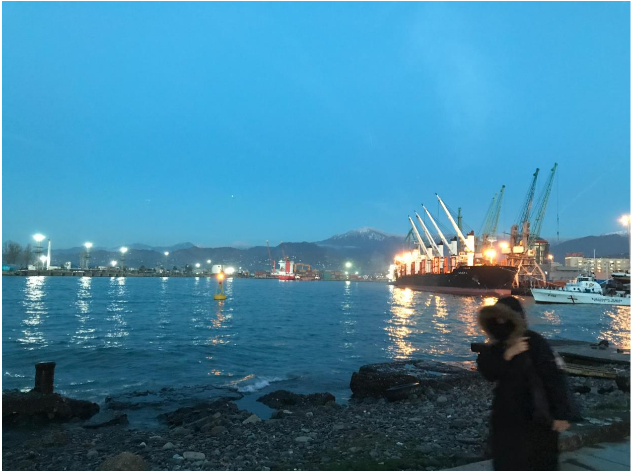
The Batumi port, photo taken January 10, 2018, by the author

This corner of the Black Sea, the capital and largest city of the region of Adjara in today's southwestern Georgia, has found itself throughout its history at the crosshairs of international networks of resource extraction, desire, and capital.