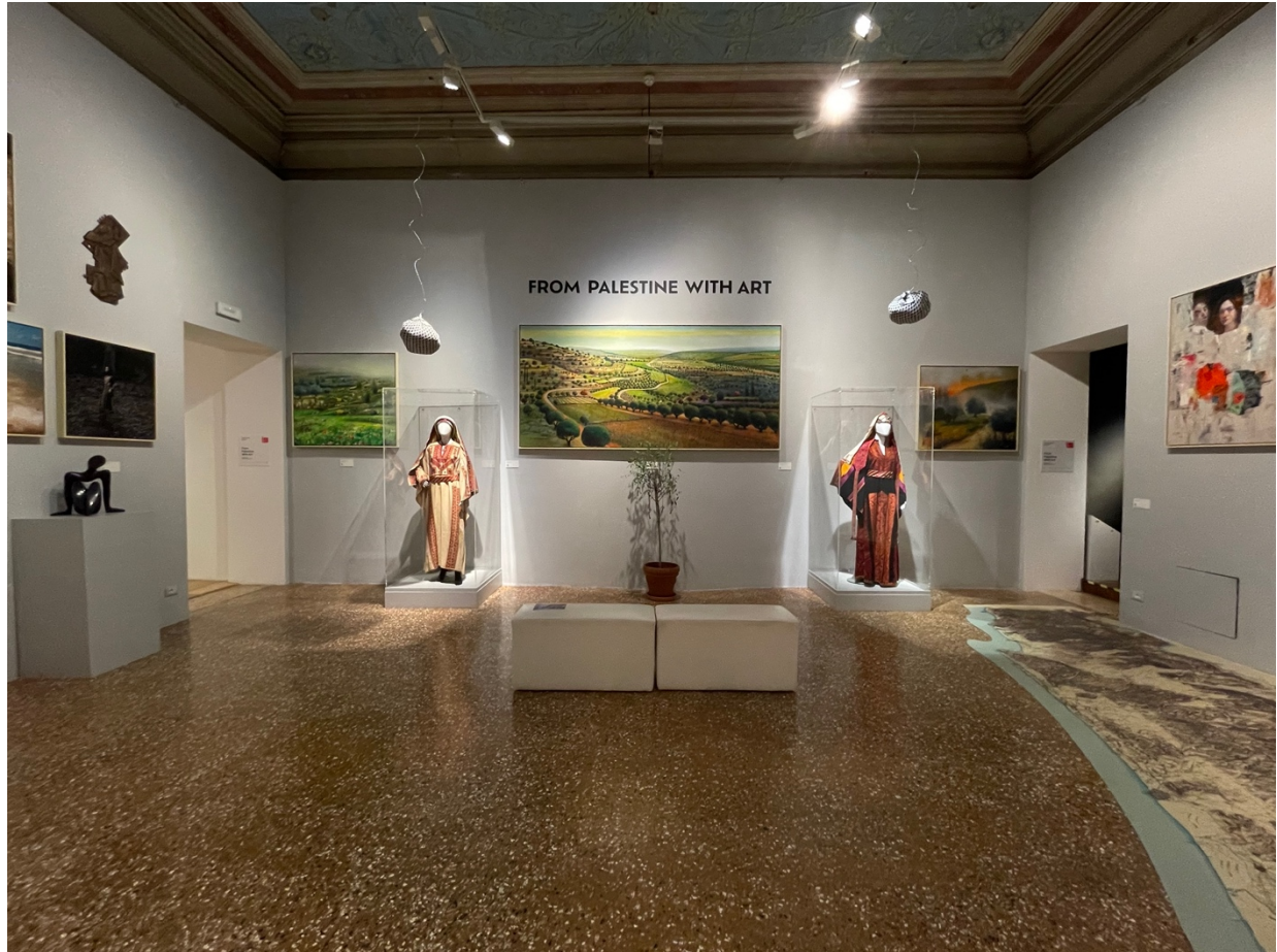
Figure. 1. Installation shot, “From Palestine with Art,” featuring work by Nabil Anani.

Venice Biennale’s only assistance is to recognize the exhibition as a Collateral Event, meaning it is included in the official program, and that the event may utilize the lion logo. Collateral Events, however, also come at the hefty price of a 25,000-euro participation fee.