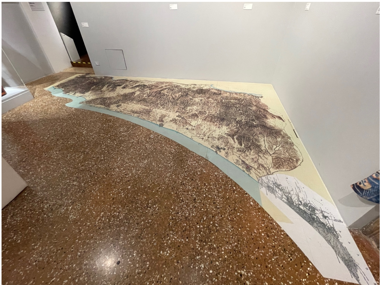
Fig. 6. Installation shot, "From Palestine with Art," featuring work by Salman Abu Sitta.

Sovereignty is also central to "From Palestine with Art." On the third wall, there are nine portraits by Jacqueline Béjani titled Palestinian Portraits (2022), and Samia Halaby's new painting Venetian Red (2021) (fig. 5). If the figures in previous paintings were abstract representations, Béjani provides recognizable faces to the broader imaginary of a Palestinian population by depicting well-known figures, including poet Mahmoud Darwish, painter Samia Halaby, and actress Hiam Abbas, among others. Many of Béjani's subjects are vocal proponents of Palestine's sovereignty and use their creative platforms to call out Israel's violent occupation. Below Béjani and Halaby's works is Salman Abu Sitta's re-creation of an 1877 Map of Palestine (fig. 6). This juxtaposition of people and place metaphorically returns individuals to stolen land and calls attention to Palestine's erasure from cartographic records after Israel's founding.