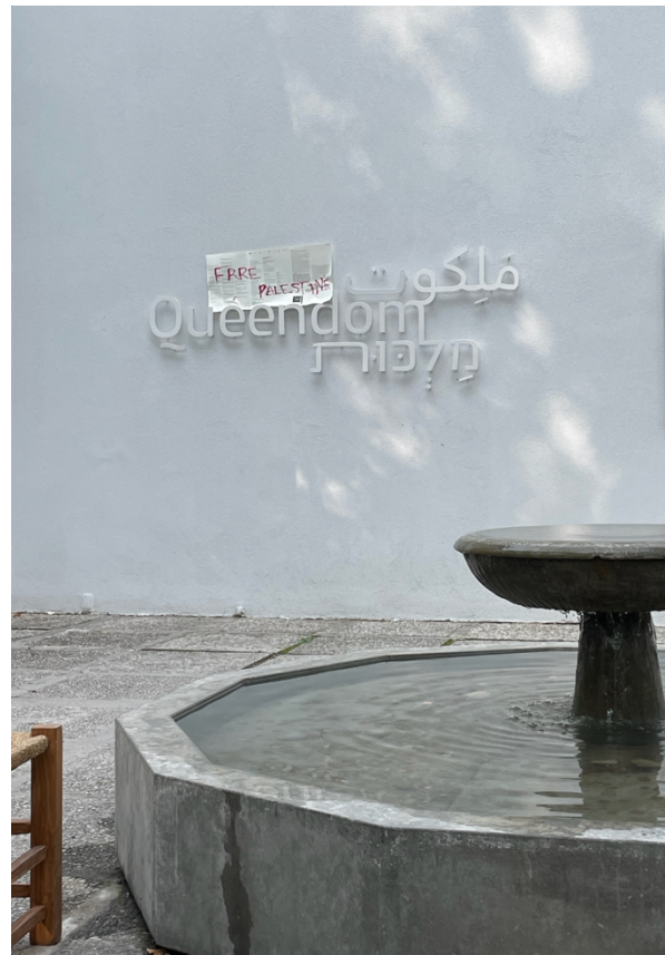
(left) Figure 3. Intervention at the Israel Pavilion at the Venice Biennale, October 6, 2022. Photograph by the author. (right) Figure 4. Installation shot, “Queendom.” Photograph by the author.