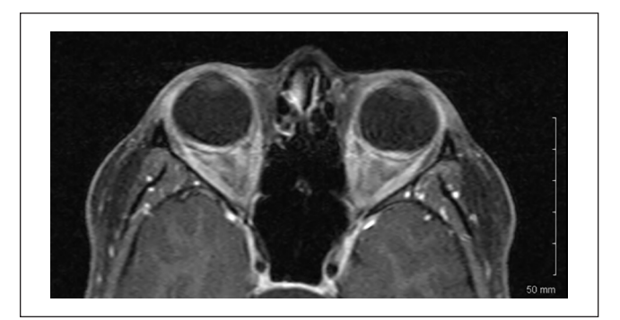
Figure 3. MR Orbit TI post contrast showing increased signal thickening at the posterior aspect of globes and focal enhancements worse on left. Abbreviation: MR, magnetic resonance.

paraneoplastic conditions and with coexistence of headache, she was sent to the hospital for evaluation. Upon admission, magnetic resonance imaging (MRI) of brain