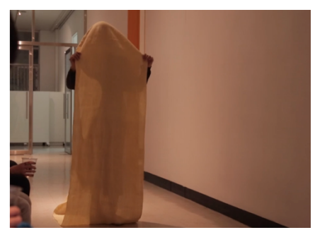
Figure 2 Screenshots from Performance with hemp mobius, MMCA Changdong Residency Seoul, 2016.

imperative."<sup>13</sup> Citizenship and national belonging are often predicated on identification through photographic documentation, with official government documents such as passports requiring a clear photograph of the passport holder. Yet Lisa Myeong-Joo uses photography as a form of de-identification and obfuscation.