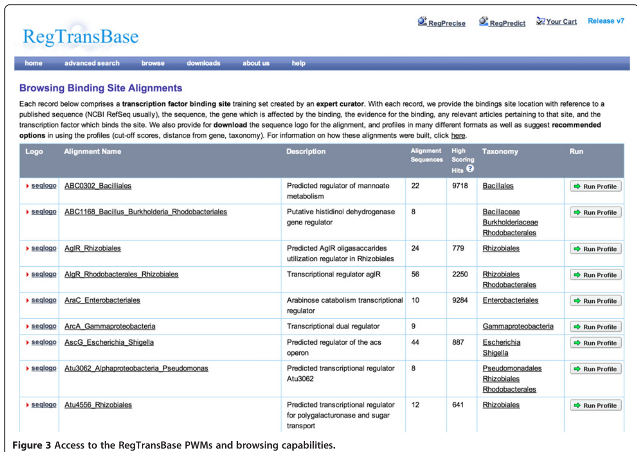
Figure 3 Access to the RegTransBase PWMs and browsing capabilities.

Positional weight matrices from RegTransBase collections can be used for computational prediction of TFBSs