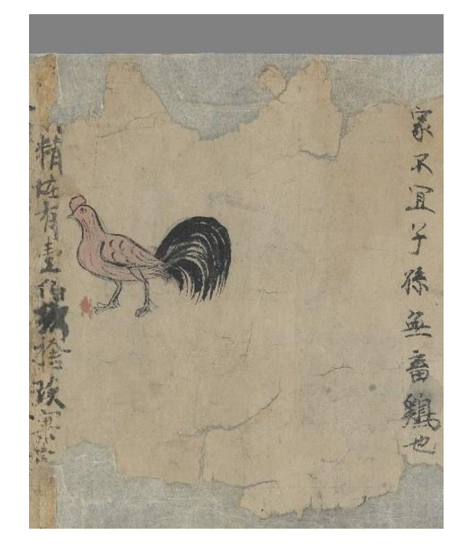
Figure 4: detail of P.2682, entries on poultry Figure 5: detail of P.2682, last entry of P.2682-1