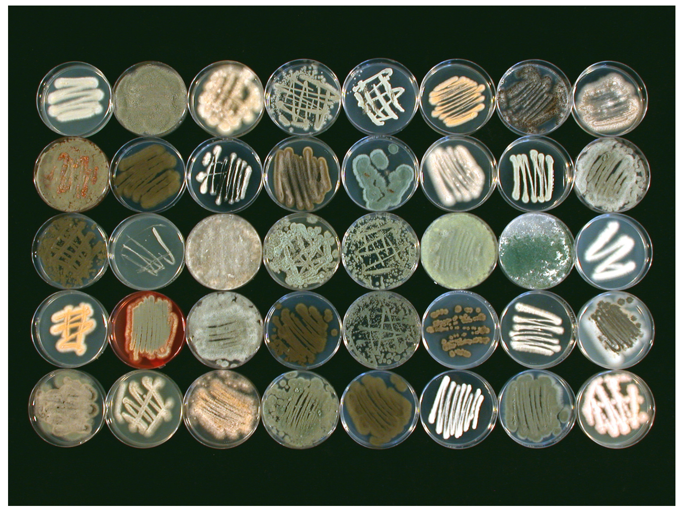
FIG 1 Morphological diversity of fungi collected from a biotic host. Fungal collection isolated from a marine sponge, Ircinia variabilis (formerly Psammocinia sp.). For details, see Paz et al. (35).

tions is largely uncharted, although recent studies have shown marine fungi to be rich sources of novel biosynthetic clusters and secondary metabolites (52, 53).