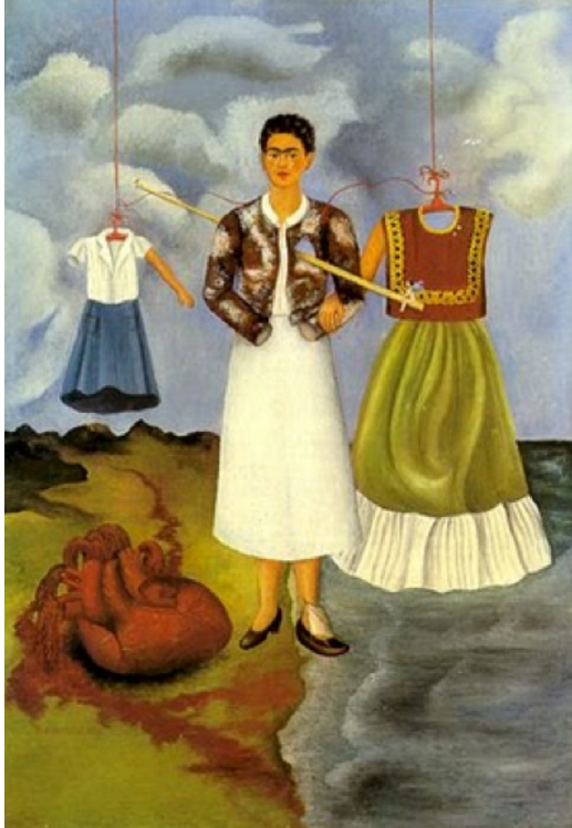
Fig. 6. Frida Kahlo, Memory (The Heart) , Dolores Olmedo Foundation, Mexico City.