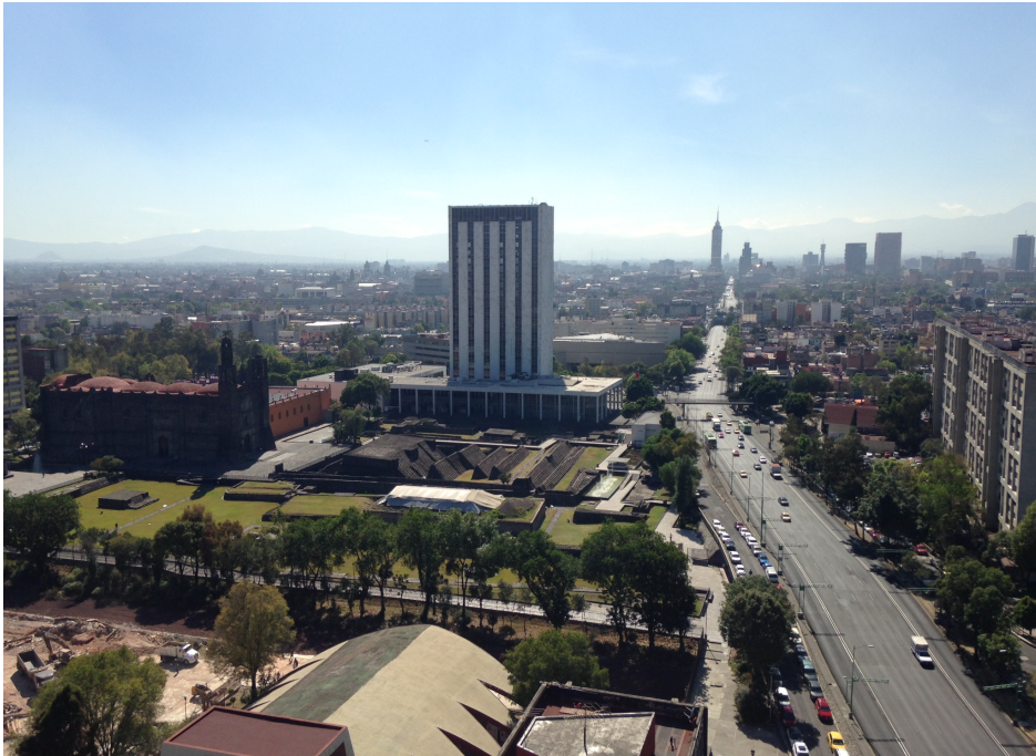
Fig. 7. Stephanie Sherman, Tlatelolco #1, December 2015.