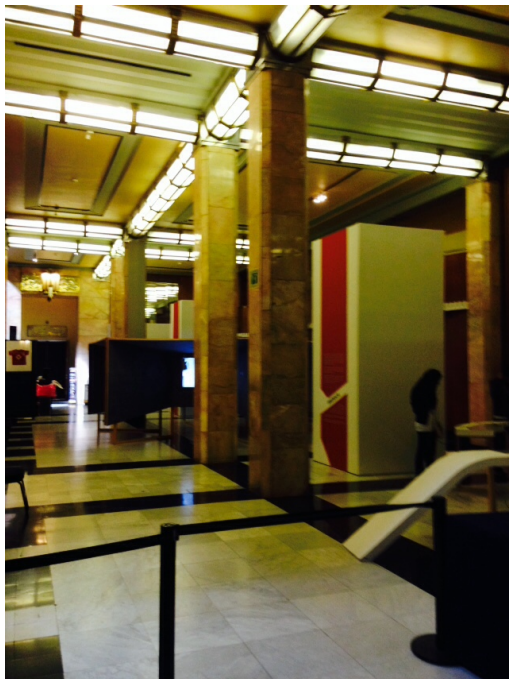
Fig. 12. Stephanie Sherman, Sala Internacional #2, December 2015.