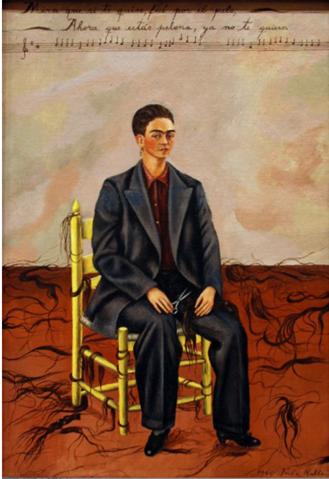
Fig. 1. Frida Kahlo, Self-Portrait with Cropped Hair , The Museum of Modern Arts, New York.