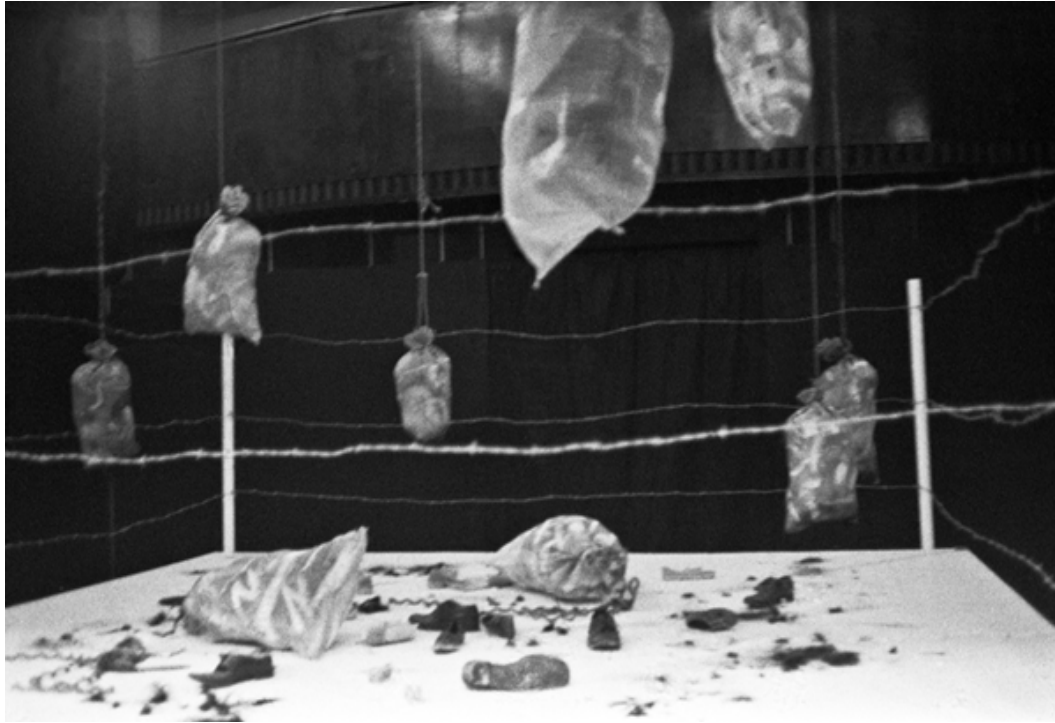
Fig. 9. Victor Muñoz, The Ring , Victor Muñoz Archive.