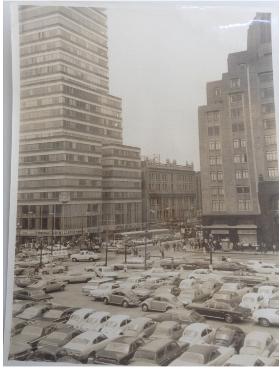
Fig. 16. Carlos Finck, View from Bellas Artes , MUAC Archive.

Finck remembers it as “a conflictive corner with a lot of traffic and . . . a sea of people, like now. It was a fight between cars and pedestrians, humans and machines” (Finck and V. Muñoz, Interview). Frequent casualties resulted from this encounter, spattering the streets with blood. Thus, Finck wanted to make un atropellado , or “a run-over man” on the street in conversation with his exploded car in the gallery. Here, he not only brought the street into the museum, but the museum into the street. Finck relates: