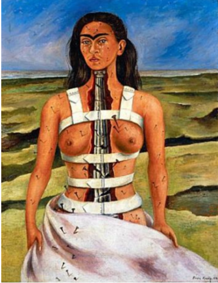
Fig. 2. Frida Kahlo, The Broken Column , Dolores Olmedo Foundation, Mexico City.

In The Broken Column (1944) (see fig. 2) Kahlo depicts herself on a harsh, open landscape riddled with cracks, or wounds; her broken torso is harshly exposed. While this space is not urban, it is unquestionably and uncomfortably public, making her breasts and wound appear all the more vulnerable. Her body is stitched together by her corset and poked with metal nails—inorganic, outside elements that allude to industry and modern medical technologies. The European ionic column often seen on public facades is an ancient symbol of Western metropolis. However, this public, urban, phallic element has deeply and violently penetrated Kahlo's private body, from her hidden groin up to her throat, metaphorically raping and splitting her.