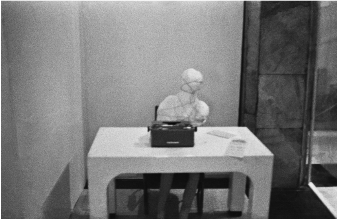
Fig. 15. Victor Muñoz, Photograph of Bound Figure , Victor Muñoz Archive. [This is a similar figure of Antonio's, though not the one facing the television.]

contrary, this figure is inundated with (one type of) information and is more confined than Muñoz's sacks or Finck's exploded car.