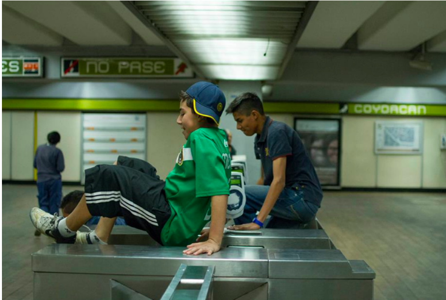
Fig. 21. Pablo Tonatiuh Álvarez, Children Jumping, 22 December 2013, Pablo Tonatiuh Álvarez Archive. [Coyoacán Metro Station]