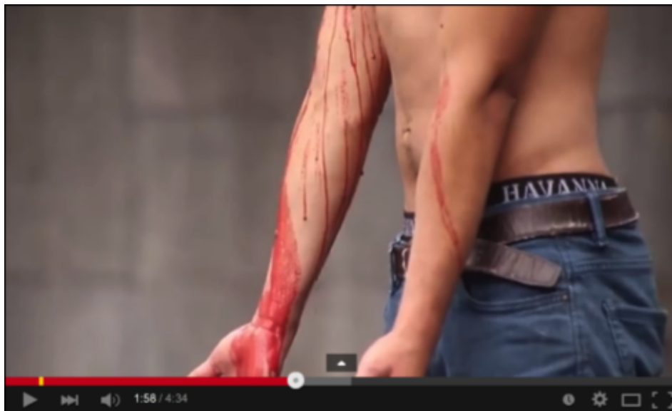
Fig. 30. Still from “Performance por Ayotzinapa.”