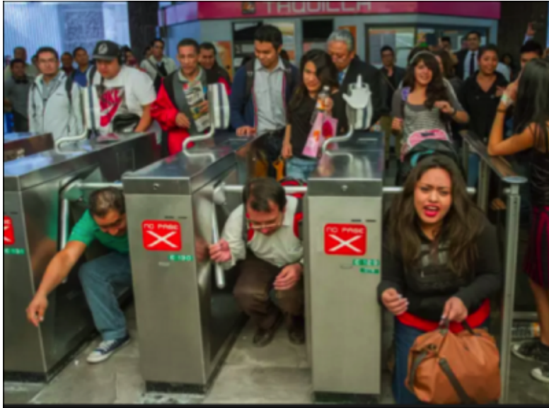
Fig. 27. Photograph from Blog PSK, 16 December 2013.

In this image (see fig. 27), two men and a woman hunch their torsos and walk in a squat beneath the turnstile, quite literally embodying the notion of the turnstile as a border constraining movement. Shaping their bodies into the tight crevice below the metal bar and between its two supports, the people move forward within the flow of other protesters who have not paid the fare. The momentary freedom achieved by moving through this constricted zone, is defined by and reacts to the strictures of space both physical and social (both the tightness of the distance between turnstile and ground, and social space, which requires a higher fee in order to pass. In effect, these strictures shape and produce the way the protesters' bodies move and determine their movements as transgressive. The potentially subservient posture of the protesters (e.g. their hunching) is a direct result of their refusal to obey and pay. Like Kahlo's painting within and against the confines of postrevolutionary gender tropes and Proceso Pentágono's critique of the state within the sponsorship of Bellas Artes, the protesters needed and utilized the support of hegemonic structures in order to question them. It is at those times when the protesters appear most subservient that they turn hegemonic constraints on their heads.