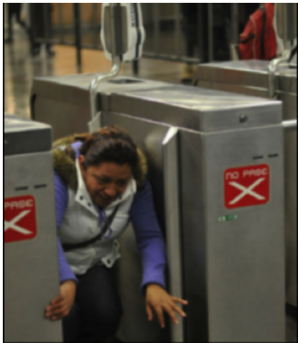
Fig. 23. Photograph from Arestegui Noticias #1, 13 December 2013, “Videos: Así es el #PosMeSalto y #PosMeAgacho, tras alza al Metro en DF.”

These jumps and crouches (see fig. 23) performatively reshaped both individual and collective bodies, resisting and re-signifying the Metro stations’ social and architectural spaces. The PosMeSalto protesters performed political gestures—one’s that do not necessarily set out to be large or impactful, but are, as Agamben would say, “means without ends” (57-58). Álvarez’s photos of Melgarejo and Zolá, then, do not merely aesthetically mimic the movement. Rather, the images encapsulate the movement’s central message of social change via the protesters’ embodied movements through political space. If we define choreography as the negotiation of spatial constraints by mobile bodies, PosMeSalto’s performativity was fundamentally choreographic. The protesters shifted spatialized power like dancers in a site-specific work, calling into question the political construction of the space. The embodied movements of the protesters within the spaces of the Metro stations had real consequences in social space, both as micro-movements of resistance and as macro-movements of rebellion. By micro-movements, I mean the small actions of the individual protesters who moved their bodies differently by jumping, ducking, or finding other creative ways of evading the fare. By macro-movements, I refer to the ways organizers coordinated or inspired masses of citizens to actively critique a system and ask for change via their actions.