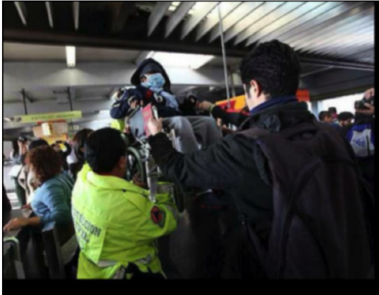
Fig. 26. Photograph from Arestegui Noticias #2, 13 December 2013, "Videos: Así es el #PosMeSalto y #PosMeAgacho, tras alza al Metro en DF."

reference to turn-of-the-century turtle-walkers as a metaphor for disability's radical potential to disrupt the modern city's flow: "Like the trickster . . . the turtle's slow pace subverts the city's rhythm by its presence" (2). The disabled performer, like the turtle, is a seemingly out-of-place character whose differential presence calls the "normal" world around it into question. Financially speaking, people with disabilities have the ability to move easily through the Metro since they ride for free. Able-bodied people, on the other hand, are limited in movement by their obligation to pay. PosMeSalto does after all, protest the economic hindrance to access created by a higher fare, and not the literal hindrance to access to disabled people produced by the Metro's predominantly disability-unfriendly architecture.