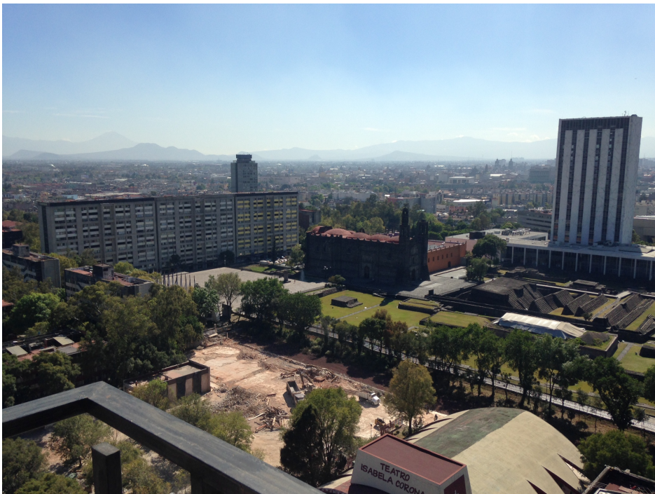
Fig. 8. Stephanie Sherman, Tlatelolco #2, December 2015.