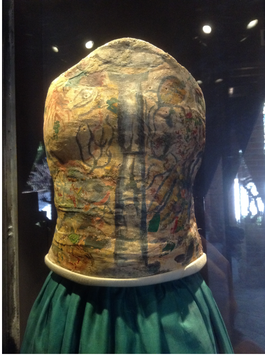
Fig. 5. of Corset in Case, Casa Azul, Mexico City.

As we see in the preceding images of her casts (see figs. 4 and 5), Kahlo projects an imaginary body via her casts with which she can move metaphorically. Some of these casts contain ornate designs that reorganize the plaster's previous open blankness; others project her institutionalized political ideology in the form of the star and sickle. The star and sickle literally politicizes her private body in institutional terms. A communist, Trotskyite, and, towards the end of her life, a Stalinist activist, Kahlo's politics extended beyond the representational politics implied in her paintings. By painting political ideology on her cast, Kahlo calls attention to her body as a site of politics, a space in which to imagine nation. Of course her broken female body clashes with masculinist heroic narratives of nation. The fetus below the star and sickle constructs this revolutionary potential through her specific female body, her ability to birth a different kind of national imaginary.