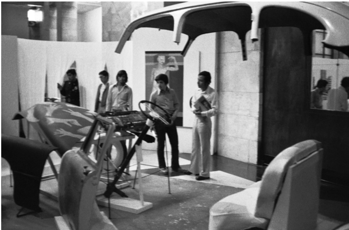
Fig. 14. Victor Muñoz, The Car , Victor Muñoz Archive.

Within the overall project of inverting spatialized urban violence in A nivel informativo as a whole, Finck’s installation The Car spoke less of direct state torture and more of a diffused violence produced by urban planning. The artwork presents a symbol of a dismembered city through an exploded car, cutting up the clean spatiality of Bellas Artes’ Sala Internacional. The vehicle appears constructed of differently colored, unfitting components; its parts are far detached from each other, drawing significant attention to the negative space between them. In