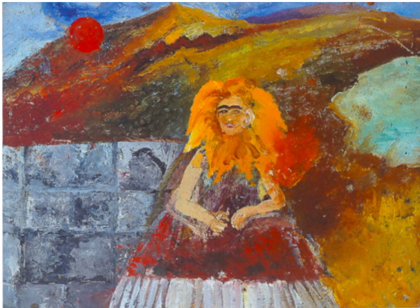
Fig. 3. Frida Kahlo, Self-Portrait Inside a Sunflower , Private Collection, USA.