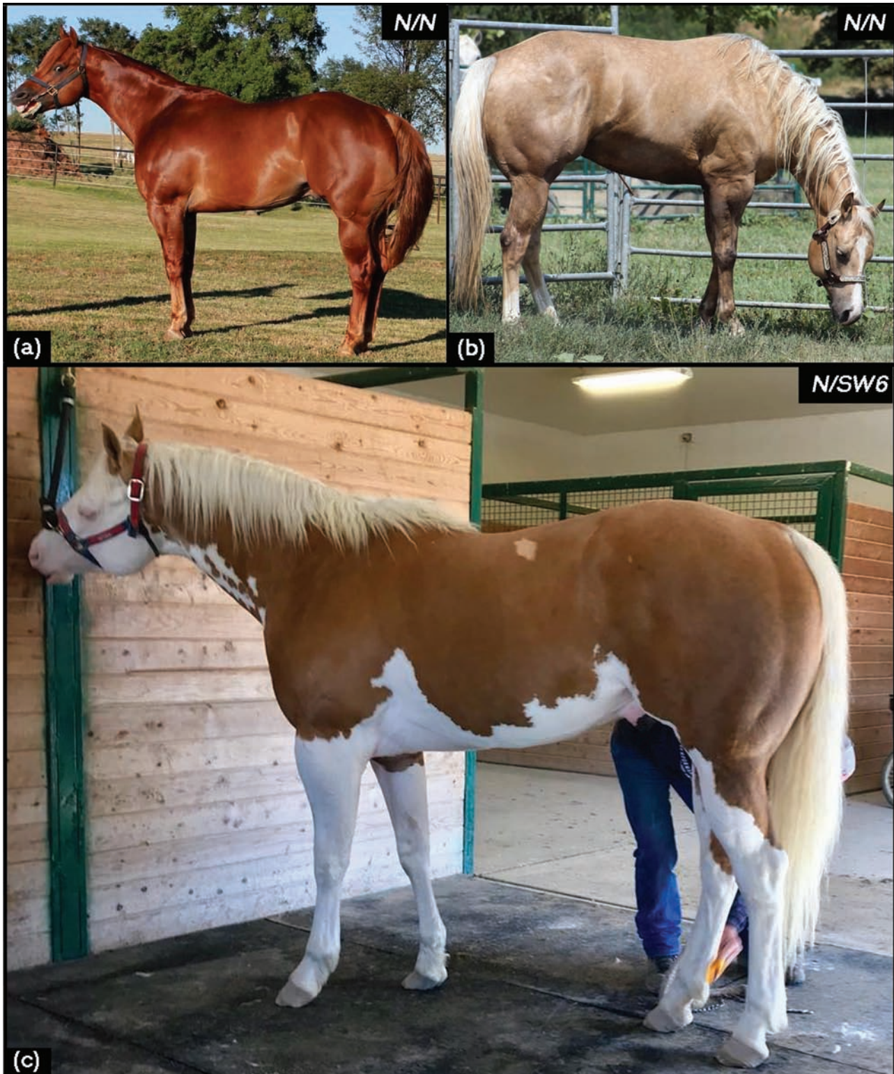
Figure 1. SW6 phenotype. A novel splashed white phenotype (c) resulted from a cross involving 2 parents without white spotting patterns (a). Sire of the identified splashed white stallion (in c) displaying a clear solid chestnut phenotype without any extensive face and leg markings. (b) Dam of the identified stallion (c) showing a palomino phenotype with minimal face and leg markings. (c) Paint stallion with a novel splashed white phenotype unexplained by any known splashed white or white patterning variants. Reported are the genotypes of each horse for the de novo SW6 mutation identified in this study.

gene in a number of breeds (Metallinos et al. 1998), whereas a variant of TRPM1 (LP) causes leopard complex spotting in the Appaloosa, among other breeds (Bellone et al. 2013). Multiple variants (W1–W28, SB1, TO) in or involving the KIT gene are