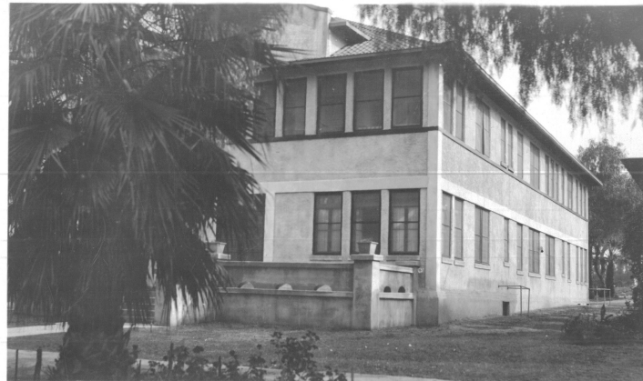
Employees' and Club Building. (New) Built by student labor.