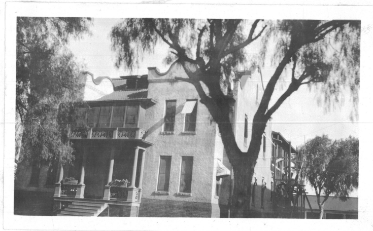
Girls Industrial Building. Notice annex and remodeling work being done by students.