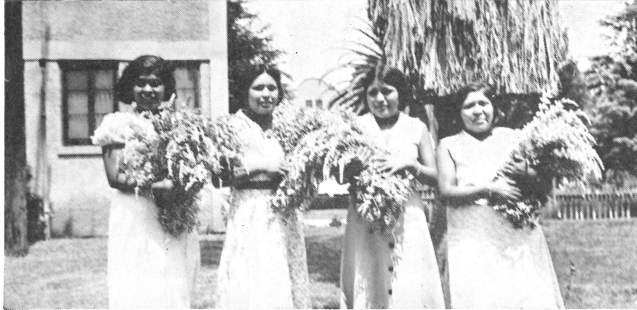
AT A PLACEMENT PARTY