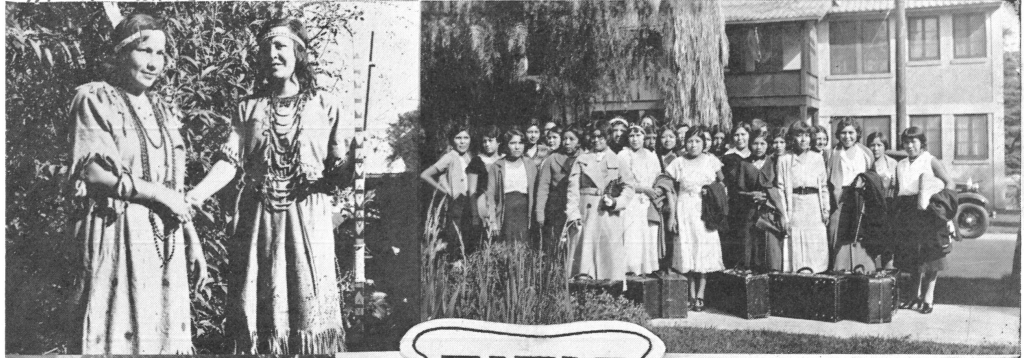
TELLING INDIAN LEGENDS - INDIAN SONGS AT A WHITE Y.W.C.A. CAMP