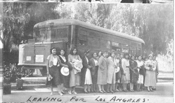
LEAVING FOR LOS ANGELES