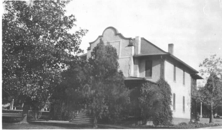
Home No. 1. - Employees' cottage. (For 12 single employees)