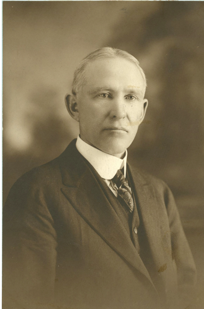
Figure 1.2. Sherman Institute Superintendent Frank Conser. Conser significantly expanded the outing system. A clerk by training, he kept careful records of the whereabouts and earnings of outing laborers.

outing system toiled as laborers on ranches and farms, and a few students worked as engineers, printers, and carpenters, or in shoe shops. 42