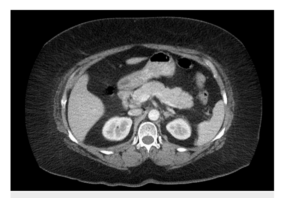
FIGURE 1: Computed tomography (CT) scan of the abdomen and pelvis with contrast showed no pancreatic pathology.

Due to characteristic abdominal pain and elevated lipase, she was diagnosed with acute pancreatitis. Magnetic resonance cholangiopancreatography (MRCP) was performed on hospital day 2 which did not show stones or any other findings suggestive of biliary tree pathology (Figure 2).