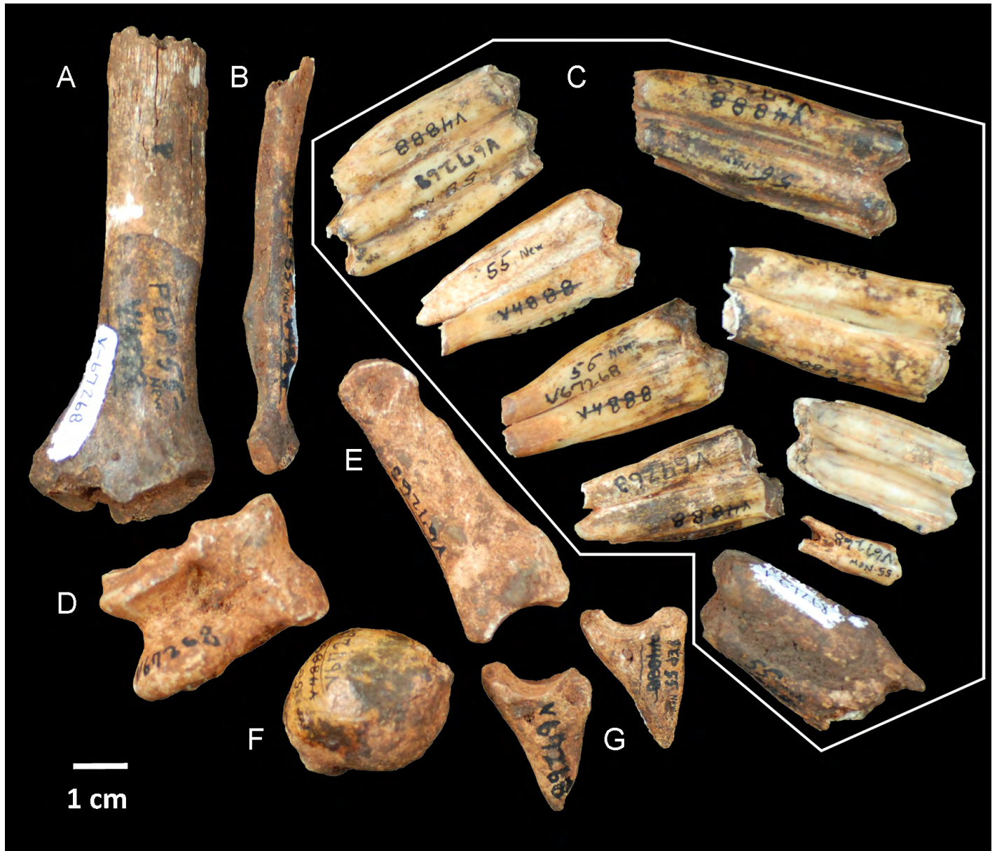
Figure 2. A–G. UCMP specimens from New Cave (UCMP V67268). The specimens have been relabeled to reflect their association with New Cave (UCMP V67268) as determined by FEP numbers. What appears to be FEP 56 is actually FEP 55. A. Left proximal radius (Class: Mammalia) B. Proximal end of rib (Class: Mammalia) C. Premolar and molar teeth (Family: Bovidae) D. Right astragalus (Family: Bovidae) E. Proximal phalanx (Family: Bovidae) F. Coprolite (Class: Mammalia) G. Distal phalanges (Family: Bovidae)

Peabody but the limited provenience information available precludes the possibility of determining whether this is the case. During the accessioning process of the UCMP, several pits have been divided into two locality numbers and given separate names. For example, Cobra Cave 1 (Pit 3; UCMP V67258) and Cobra Cave 2 (Pit 3; UCMP V75132) represent two distinct localities in the UCMP collections, but originate from a single pit excavation. Corresponding UCMP locality numbers, pit numbers and cave names can be tracked in Table 2.