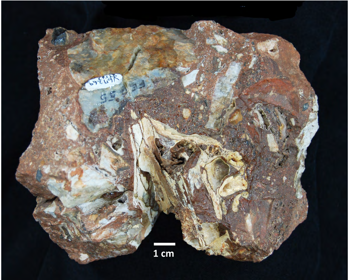
Figure 3. UCMP specimen from Jackal Cave (V67269). Canis mesomelas partial cranium in breccia, with the palate in oblique ventral view, UCMP 89567. The rostrum extends upwards toward the middle of the block, and the left maxillary dentition is visible to the right. The breccia block also contains several micro-mammalian bone fragments.

composition (Berger 1993, Berger et al. 1993). The UCMP houses 761 specimens from this locality, the majority of the sample consisting of artiodactyls, rodents, soricomorphs, perissodactyls, and chiropterans (Table 3).