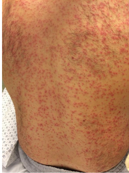
Figure 1. Monomorphic erythematous papules with petechiae

Physical examination revealed 1-2 mm erythematous, discrete monomorphic papules and some petechiae symmetrically scattered on his face, chest, abdomen, back, bilateral arms, glans penis, and buttocks (Figure 1).