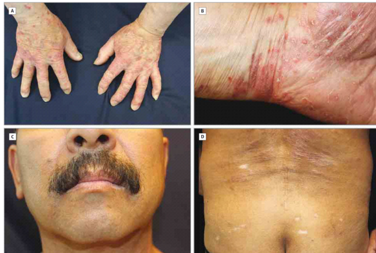
Figure 1. Cutaneous Adverse Events During Treatment With Pembrolizumab

A, Macular papular eruption involving the dorsal surfaces of both hands. B, Macular papular eruption involving the palmar surface of both hands. C, Spontaneous hypopigmentation (vitiligo) on and around lips. D, Scaly macular papular eruption on the lower back with some hypopigmented postinflammatory regions.