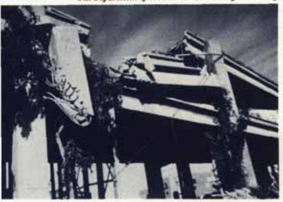
The double-decked section of I-880 in Oakland collapsed, crushing motorists on the lower deck.

U.S. Department of the Interior U.S. Geological Survey