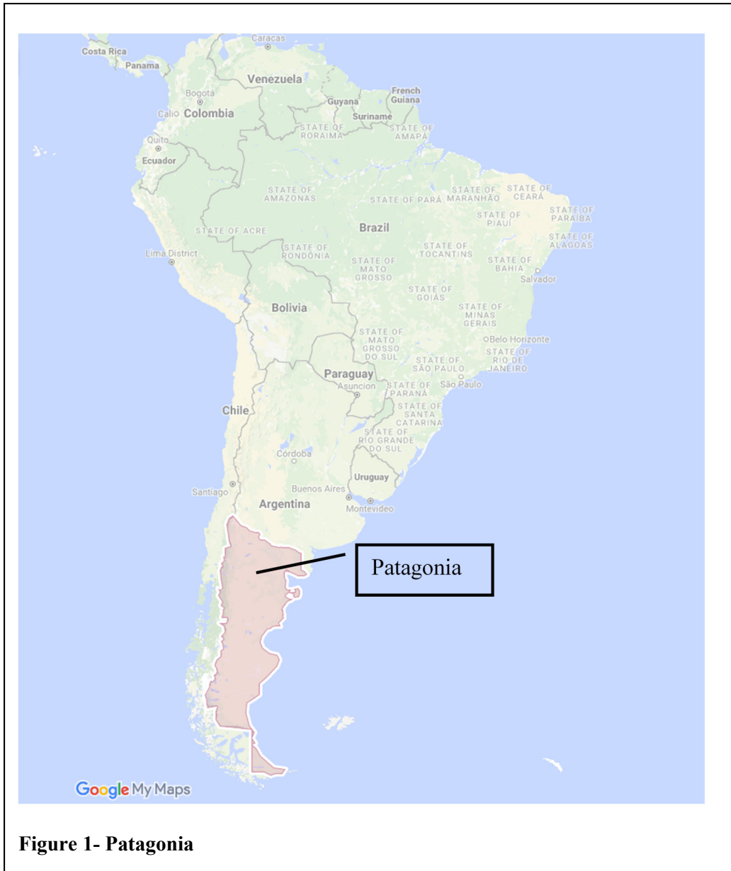
Figure 1- Patagonia

Patagonia developed a resilient, flexible, and democratic political arrangement, a kind of “skeletal state.” The “skeletal state” arrangement rested on two pillars: the minimal—but not absent—administrative scaffolding of the early National Territories administration, and an ad-hoc system of social networks built at the municipal level. Key components of this “skeletal state” were the federal courts, the single largest state institutions in northern Patagonia between 1884 and the late 1930s, when the arrival of new actors—National Parks administrators, customs officers, oil managers—would fundamentally change the way settlers interacted with the suddenly ubiquitous state.