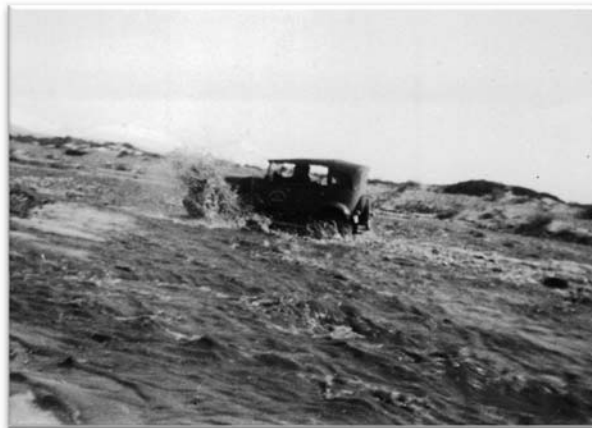
Figure 5. “Cruzando el Río Atuel- La Pampa, 1937”—infrastructure investment lagged throughout the period. (AGN, Inventario #48432)

providing an avenue for political participation for non-elites. As we will see throughout this dissertation, humble, barely-literate settlers relied on direct appeals to the governor in an effort to break through local arrangements designed to keep them from accessing justice. The governor’s insularity made him institutionally ineffective, but made him independent from regional, small-town elites whose patronage and vote he did not need. Their ineffectiveness at attracting investment, directing development, or creating political machines was a stark contrast to appointed governors in the Western Territories of the United States. There governors were able to exploit the “permissiveness” of the frontier arrangements to enrich themselves and bring prosperity to their region. 53 In northern Patagonia the lack of federal funds to develop anything outside of the Río Negro valley exacerbated the lack of creativity by regional authorities to find alternate sources of funding to pursue transformative projects. Governors ultimately made the state in the frontier as a whole more responsive to complaints against its agents’ abuses, in particular when the number of police officers roaming the countryside ballooned in the mid-1920s, leading to increased settler unhappiness.