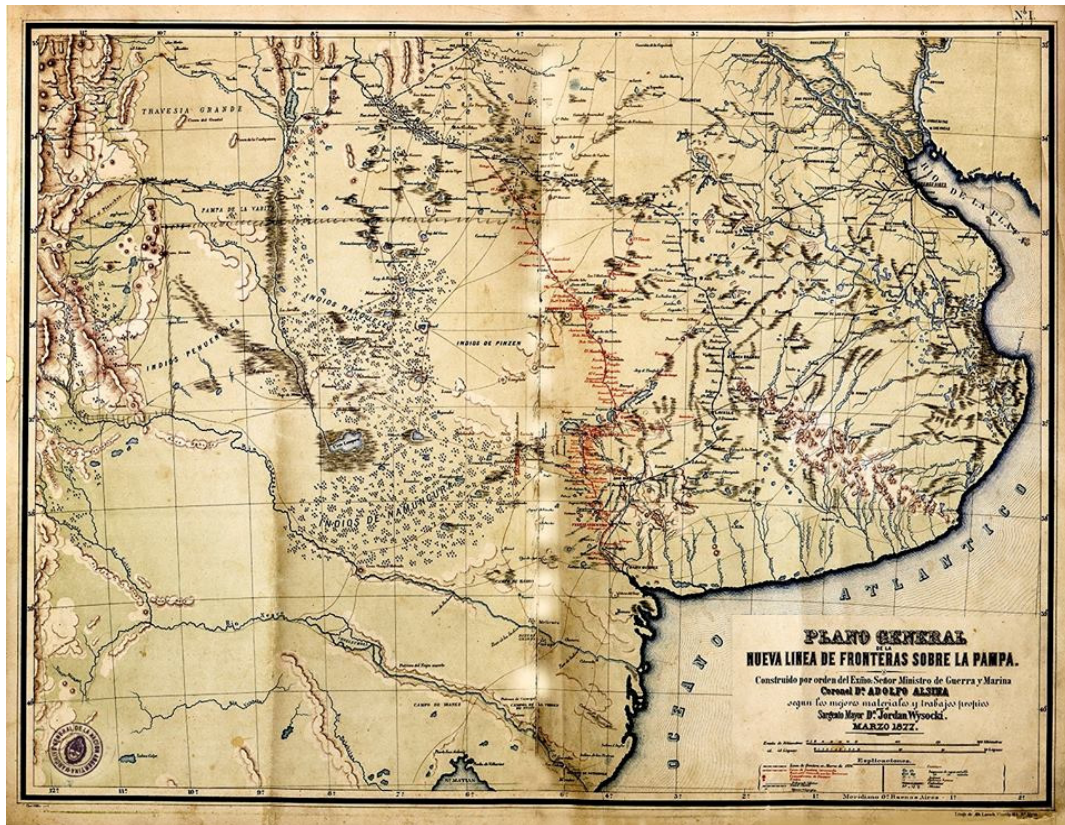
Figure 1- Diagram of the new “frontier line” commissioned by Adolfo Alsina and completed by Jordan Wysicki in 1877 shortly before the minister’s death. (From AG, Mapoteca II-130)

Patagonia had been a fluid, dynamic space for centuries—a borderland between Spanish colonial society and nomadic cattle traders. Rancher encroachment on indigenous territory in the 1860s and early 1870s, coupled with failure to sustain treaty obligations by Argentine authorities, led to a series of malones [Indian cattle raids] that emptied large swaths of the frontier. In that context, the Argentine government changed its frontier policy rather swiftly during the 1870s, from coexistence to Indian removal. President Nicolás Avellaneda (1874-1880) argued that simply defeating the indigenous people would not solve the issue; Argentina needed to occupy all of their territory, and in the process expand the productive surface of the country.