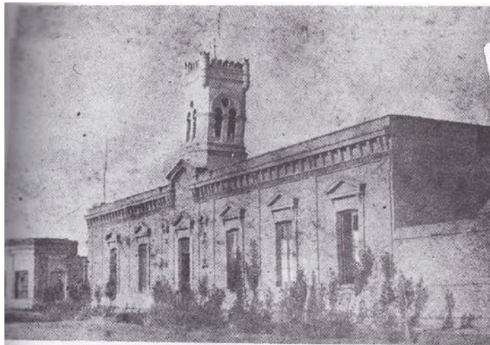
Figure 7- The Military Command building in Genral Roca (1898). Destroyed by the 1899 flood. Symbolically, the building’s “very weak” foundation was singled out by state officials as the cause for its destruction, according to Vapnarsky (1983, p. 135). (Image from the AGN)

The Río Negro Valley region was the area of earliest settlement after the Conquest, and the one which received the most significant commercial and productive investment. Following the confluence of the Neuquén and Limay rivers, the meandering Río Negro valley traverses the entire width of the continent, carving a ten-kilometer-wide fertile floodplain valley, which is presently characterized by dense population spread out into several towns webbed together by roadways and irrigation canals. The upper Río Negro valley had the highest population concentration of the region, clustered around two urban centers: the Neuquén-Cipolletti-Plottier metropolitan area (straddling the confluence itself) and the General Roca-Villa Regina-Allen metropolitan area further down river. The most important settlement of the middle Río Negro valley is Choele-Choel, which is surrounded by smaller settlements like Fray Luis Beltrán, Lamarque and Pomona. Finally, the lower Río Negro Valley comprises a less densely populated stretch of the valley, roughly from the town of General Conesa to the Viedma-Carmen de Patagones metropolitan area close to the river’s mouth, and including San Lorenzo (with its famous beet-sugar mill) and Guardia Mitre between them.