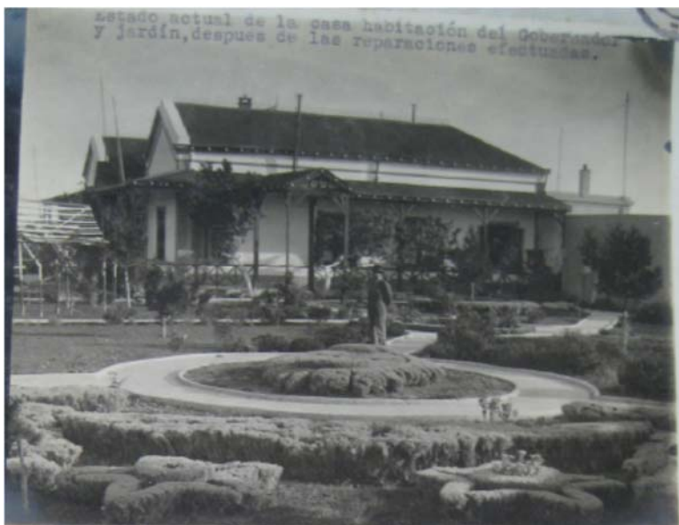
Figure 4. The newly revamped Governor’s mansion in Rawson (Chubut), in 1932. Compare with the earlier Neuquén one (Fig 3).

irrigation canals, in particular, lagged behind, especially in more remote areas despite continued pleas and complaints by governors who either praised or condemned proposed public works in their reports (notice in Fig.5, the continued lack of bridges.) 51 The governors also had limited