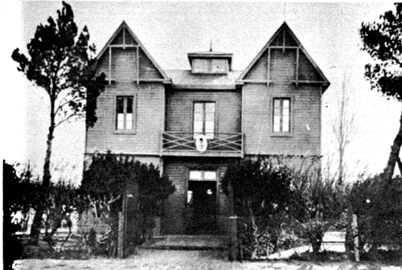
Figure 3. Neuquén’s governor mansion, built in 1904 and torn down in 1953. Later it also served as the seat of the municipal council. (Image from the newspaper archives of Río Negro, around 1940).

The role of the governors in the Patagonian territories, as described by Río Negro’s first civilian governor José Eugenio Tello, was a fairly limited and frustrating one: