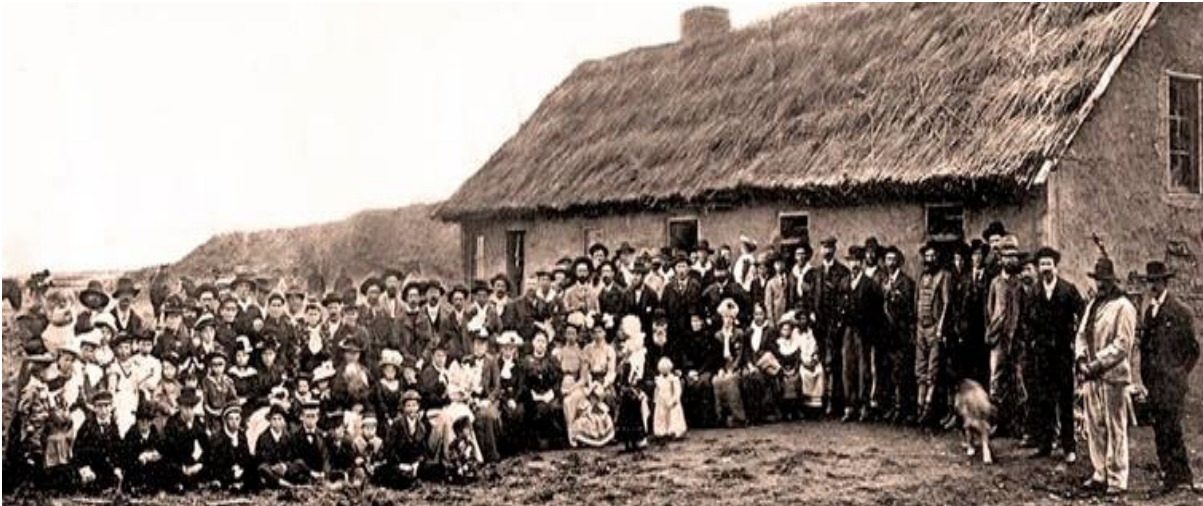
Image 1 —[untitled] The participants of the 1902 plebscite in Trevelin.

The Welsh established a large agricultural colony in the 1890s, known as “Colonia 16 de octubre,” in a long longitudinal valley carved by the Percey and Corintos rivers, which poured their glacial, turquoise waters into the Pacific, making the valley one of the contested areas between Argentina and Chile. At either end of the valley they established towns: Trevelin and Esquel. The valley was isolated geographically from the other Welsh colonies located across the plateau on the Atlantic coast of the Chubut Territory, and the railroad connecting it with other Andean valleys would not arrive until the 1920s. 45 Without many Chilean settlements to trade with in the rugged fiords of the Pacific coast until the 1930s, the Welsh colonists developed almost complete segregated from anyone outside their valley—except their compatriots in the