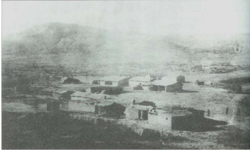
Figure 2- Chos Malal, the original capital city of the Neuquén Territory.

Note the lack of monumental architecture, the relative simplicity of the constructions and the overwhelming desolation of the natural setting. The lack of comforts and amenities contributed to governor absenteeism.