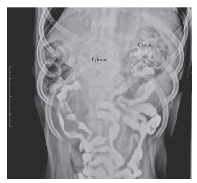
Figure 1. Standard ventrodorsal image obtained during the pre-operative upper gastrointestinal series. The gastric axis is clearly identified due to the presence of positive contrast material (barium). Note the unusual location of the pylorus on midline.

Surgical exploration of the abnormally positioned stomach and abnormal pyloric outflow tract was recommended, and an exploratory celiotomy was performed. The patient was premedicated with hydromorphone (West-Ward Pharmaceuticals, Eatontown, New Jersey, USA), 0.05 mg/kg BW, IV, acepromazine (Vedco, St. Joseph, Missouri, USA), 0.01 mg/kg BW, IV, and atropine (Vedco), 0.02 mg/kg BW, IV. Anesthesia was induced with ketamine (Fort Dodge Animal Health, Fort Dodge, Iowa, USA), 5 mg/kg BW, IV, and diazepam (Hospira, Lake Forest, Illinois, USA), 0.5 mg/kg BW, IV, and maintained with inhaled isoflurane. An approximately 8-cm surgical scar was noted along the cranial one-third of the ventral abdomen on midline, consistent with the patient's previous gastropexy procedure. A standard ventral midline celiotomy was performed, extending from the xiphoid to the prepuce, and was approxi-