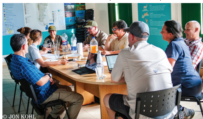
FIGURE 4. Onsite consultations and workshops with the five focal parks.

The SST traveled to Argentina twice to conduct onsite consultations at the five focal parks (Figure 4).