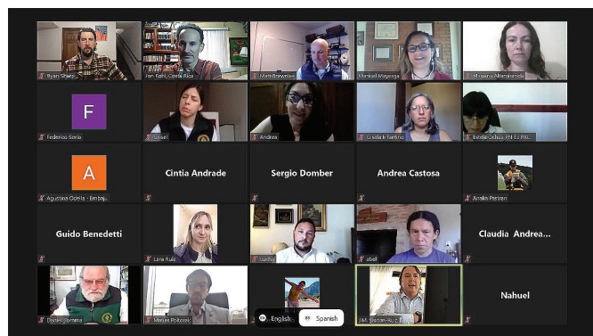
FIGURE 3. Webinars and virtual meetings with park staff and officials were sustained during the first three years of the project. The president of APN attended the meeting depicted in this screenshot and can be seen in the lower leftmost frame.