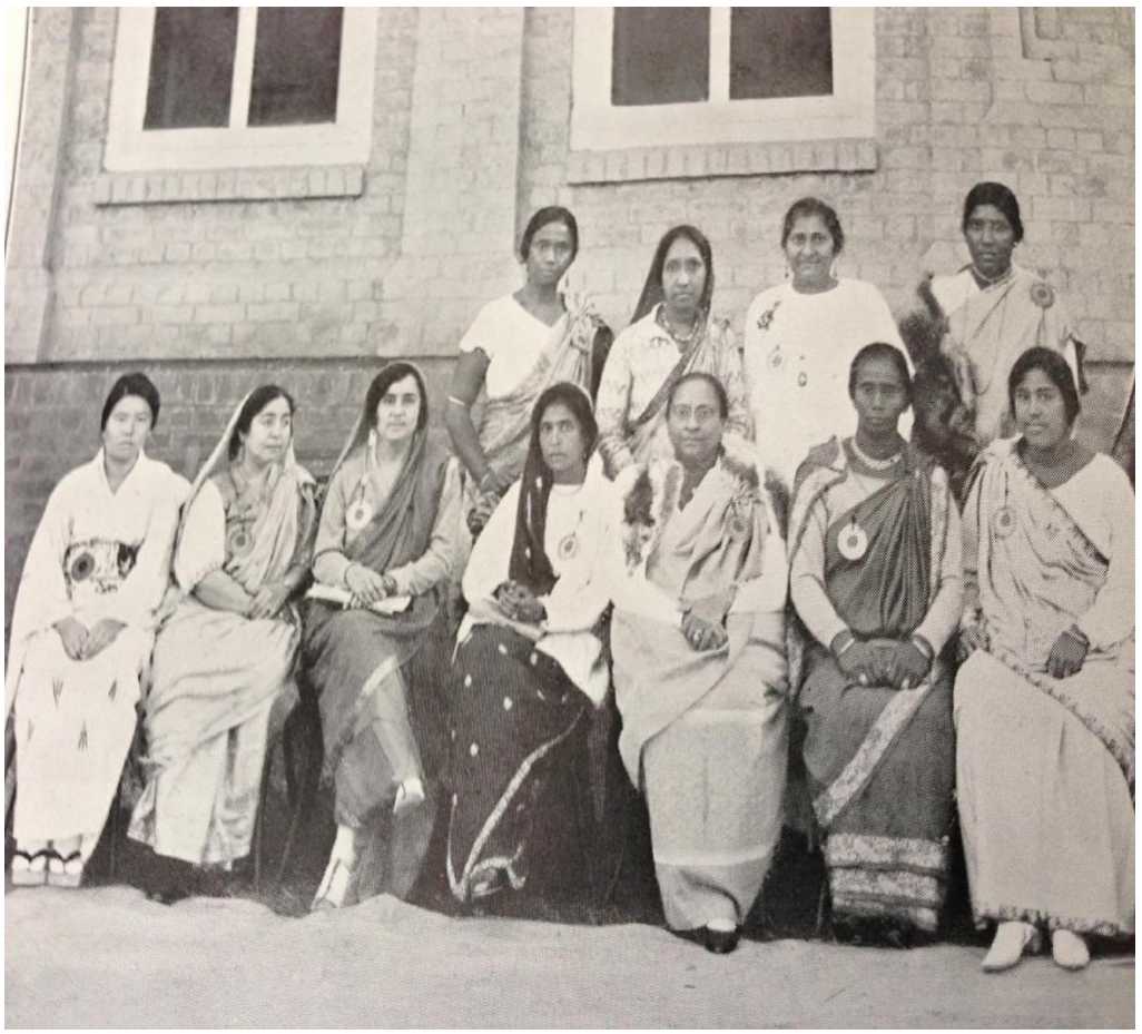
Figure 15: Shirin Fozdar at the All-Asia Women's Conference in Lahore, 1931 (fourth from left)