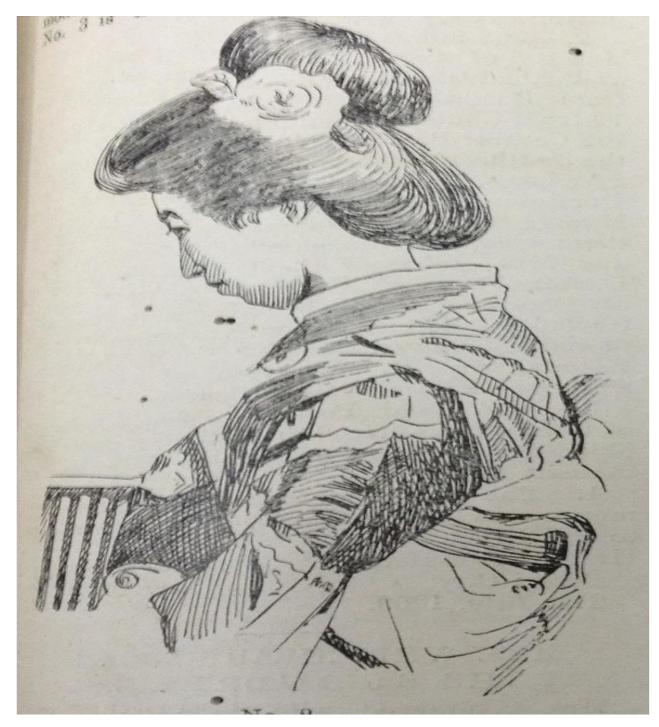
Figure 8: Close-up "Four Fashions of Hairdressing in Japan", Indian Ladies Magazine, July 1909.

"An Education of the Head, Hand and Heart": Idealizing Japan in Debates about Higher Education for Women in the Indian Ladies Magazine, 1900-1918.