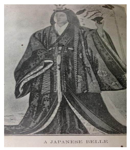
Figure 10. Frontispiece, ILM, Vol IX, No.2, August 1909

Other issues continue this preoccupation with Japan. Readers are told by way of a published excerpt from The Madras Mail that a fundraising concert for ILM was held in the city and that the evening's entertainment programme was inaugurated with a "pretty action song" during which the editor and a group of children (all Indian) were "all gracefully attired in Japanese dress".<sup>187</sup> It seems significant that this evocation of Japan occurs before the regular programme of enacting various tableaux from Hindu mythology and recitations of Victorian poetry and songs. In almost each issue of the magazine between 1909 and 1918, there are ethnographic, informative pieces on Japanese culture that include discussions about aspects of national dress such as 'obi,' 'tabis' and 'hakamas.' However, they are not limited to sartorial preoccupations. Colonial travel narratives about Japan also feature in these issues as do, most significantly, comparative assessments of Indian and Japanese female education.