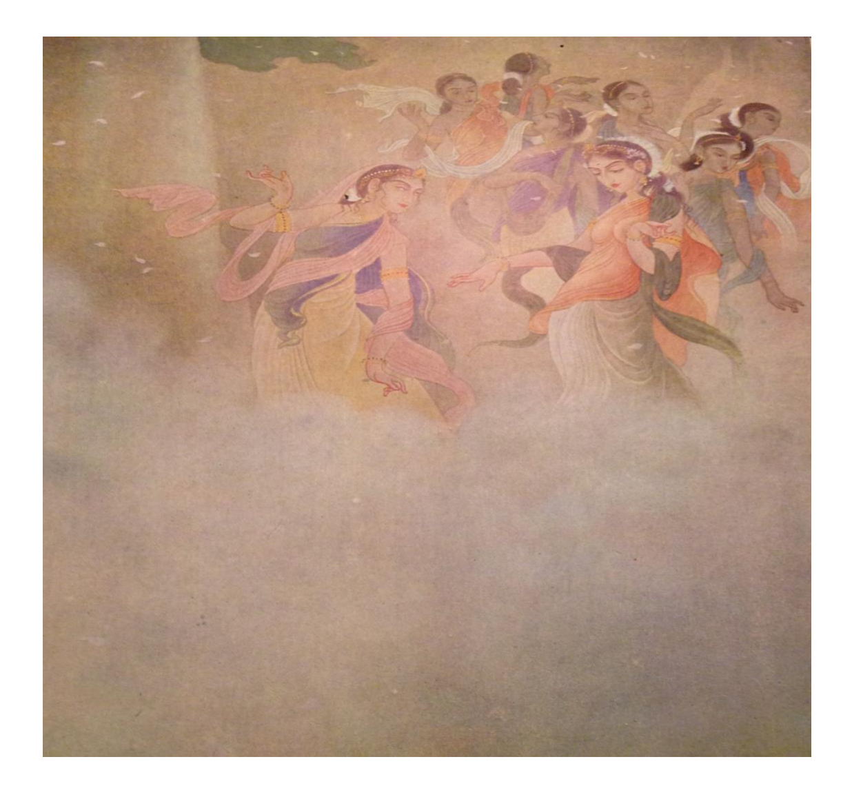
Figure 1: Heavenly Apsaras by Yoshio Katsuta, 1907; Printed in Rupam, 1921