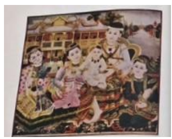
Figure 7: A Burmese painting, Domestic Felicity , frontispiece for the Modern Review , November 1916.

Victorianism and Modernism. The protagonist in many of the stories is an ethereal "nymph" like character<sup>166</sup> who roams in ethereal natural landscapes (far removed in time and space from Bengal), falls in love with a young man and has to undergo some kind of act of renunciation in order to fulfil either him or the situation. To provide an example, in "The First Lotus" a beautiful woman called Light follows a young man in an enchanted natural paradise.<sup>167</sup> She is asked to choose two flowers – one white and pure, the other overpoweringly fragrant and red. She chooses