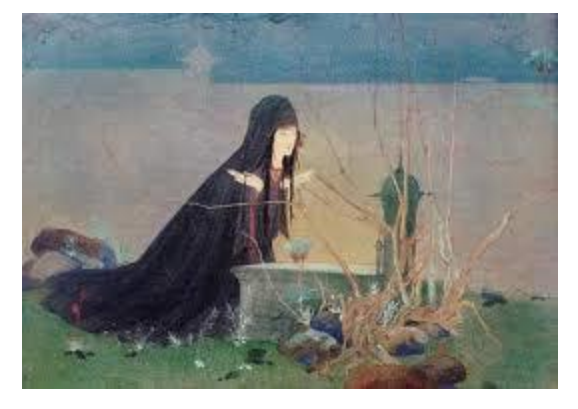
Figure 6: 'The Resting Place' by Abdur Rahman Chughtai. c. 1927, National Gallery of Modern Art, New Delhi.

1910 and 1920, the Modern Review also regularly featured short stories and novels in serialized form. These have escaped the notice of most commentators on the magazine, possibly because it is difficult to pinpoint what aspects of the cultural history of the period are animated in these somewhat dreamy and whimsical pieces. In tenor they approximate the genre of Victorian popular