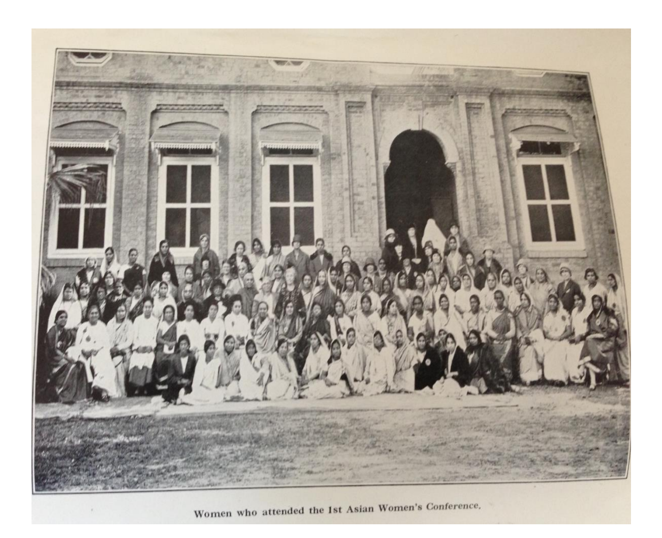
Figure 14: Participants of the All-Asia Women's Conference, Lahore, 1931, AAWC Report