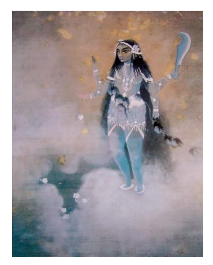
Figure 2: Yokoyama Taikan, Indo Shugojin (Indian Guardian Goddess) (1903). From Inaga, 2009.

The Bengal School of Art led by Abanindranath, in turn, "aimed to create an 'oriental art' by assimilating different Asian cultures" (see for example Nandalal Bose's use of Japanese watercolor technique in fig.3).<sup>49</sup> This interesting and rich intersection of artistic milieus, however, waned considerably with the rise of Japan's imperialist ambitions in the 1930s. Attacks on China and the occupation of Manchuria undercut the dream of a unified Asian fraternity.