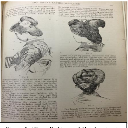
Figure 9. "Four Fashions of Hairdressing in Japan", ILM , August 1909.

catered to the tastes and concerns of a burgeoning middle class Indian Anglophone population. In between a discussion of knots and combs and finely etched drawings of different kinds of hair arrangement in Japan, one can detect a thematic undercurrent that the British male author of the piece whispers in parenthesis: "Japan is progressing!"<sup>185</sup> We are told that married women fix their hair in a particular way, to distinguish themselves from 'misses' and that at the hair dressers it generally takes over thirty minutes to finish one hairstyle. But we are also informed that nowadays this practice is dying out. Young women increasingly prefer a new type of fashion that is "cheap and easy". The choice of schoolgirls and women employed in post offices, railway stations, firms and offices - the braided knot - is all the rage. Meanwhile men, the writer tells us, already abandoned their custom of wearing the hair long back in the "old, old days,