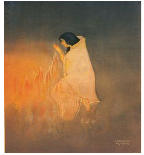
Figure 5: Nandalal Bose, Sati (1907), on the practice of bride immolation. National Gallery of Modern Art, New Delhi.

A question that is rarely raised in discussions about political as well as cultural expressions of pan-Asianism in India in this period is: how, if at all, did women themselves contribute to it, aside from standing in as figurative representations of the East? One reason why female pan-Asianists are hard to come by, especially in the early 1900s period, is that there were very few Indian women were active politically speaking before the onset of what has been called the "Age of Associations" or the first mass movements under Gandhi in the 1920s. Women did produce literary texts as scholars such as Gail Minault and Geraldine Forbes have argued, but these tended to focus on aspects of female lived experience that male narratives tended to eschew and questions of social reform. Yet, it is also the case that scholarly analyses thus far have tended to