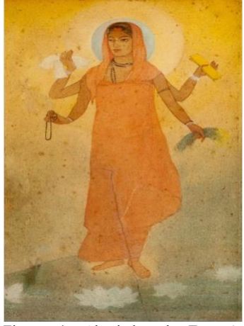
Figure 4: Abanindranath Tagore's iconic 'Mother India' or Bharat Mata painting, 1905. Rabindra Bharati Society Kolkata

Yet Inaga has underscored that there was a political investment in Asianism that also motivated this artistic exchange. Okakura's famous slogan "Asia is one", he argues, must be interpreted as a "manifesto articulating political aims and the desire for Indian independence in the particular socio-historical context of Bengali nationalism at the beginning of the twentieth century."<sup>161</sup> Okakura had come to Calcutta to foster a pan-Asian alliance in resistance to increasing Western incursions into Japan. It was the convergence of interests between these two causes that created the "underlying cross cultural conditions which over-determined Abanindranath's creation of Mother India."162 Following on from this point, it is possible to see the paintings produced by the School in the period between 1900 and 1920 as strongly reflective of the Asianist aesthetic discussed in Part B. Taken as a whole, they tend to celebrate lone figures (mostly female) who are lost in reveries of meditation or reflection. The combination of the wash technique, mythological or ancient themes and simplicity of