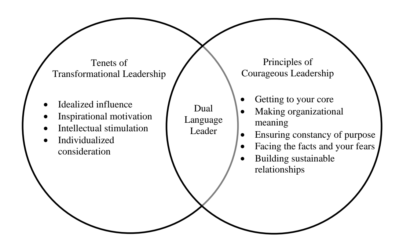
Figure 1 Transformational and Courageous Leadership