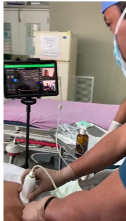
Image 3. Ultrasound positioning while tele-ultrasound is being employed to provide live needle guidance.

In our POCUS fellowship training program in Peru, we