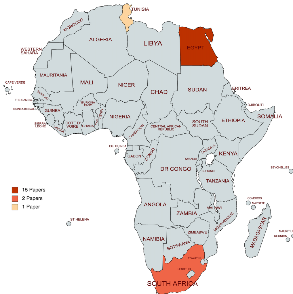
Fig. 2 Geographic Distribution of Prospective Endometrial Cancer Research within Africa. The map represents individual countries only and does not clearly illustrate some of the smaller African countries

“Good” ( n=8 ) or “Fair” ( n=4 ) studies, with the majority of studies attaining “3 or 4 stars in the selection domain AND 1 or 2 stars in the comparability domain AND 2 or 3 stars in the outcome/exposure domain” [23]. Cohort studies scored as “Fair”, either had deficiency in the selection or comparability domains. The two randomized controlled trials were scored as “High risk of bias” and “Some concerns”, respectively, due in large part to deficiencies in the “Outcome” and “Reporting” sections, suggesting a need for improvement of these sections during the study-planning phase.