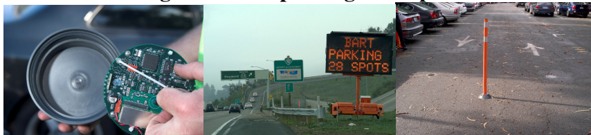
FIGURE 1 Images of smart parking field operational test.