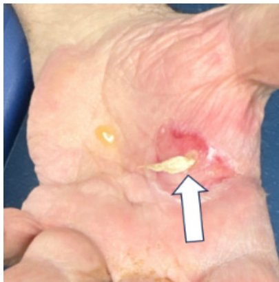
Image 1. Photo of patient's left hand with spontaneous tendon rupture (arrow) present as well as serosanguinous fluid present.

He was diagnosed with acute limb ischemia suspected to be secondary to an acute arterial occlusion, as well as spontaneous flexor tendon rupture secondary to an abscess within the