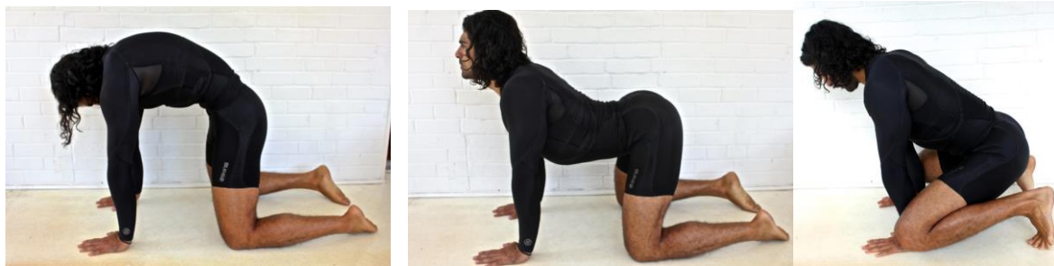
Fig. 2 (a)