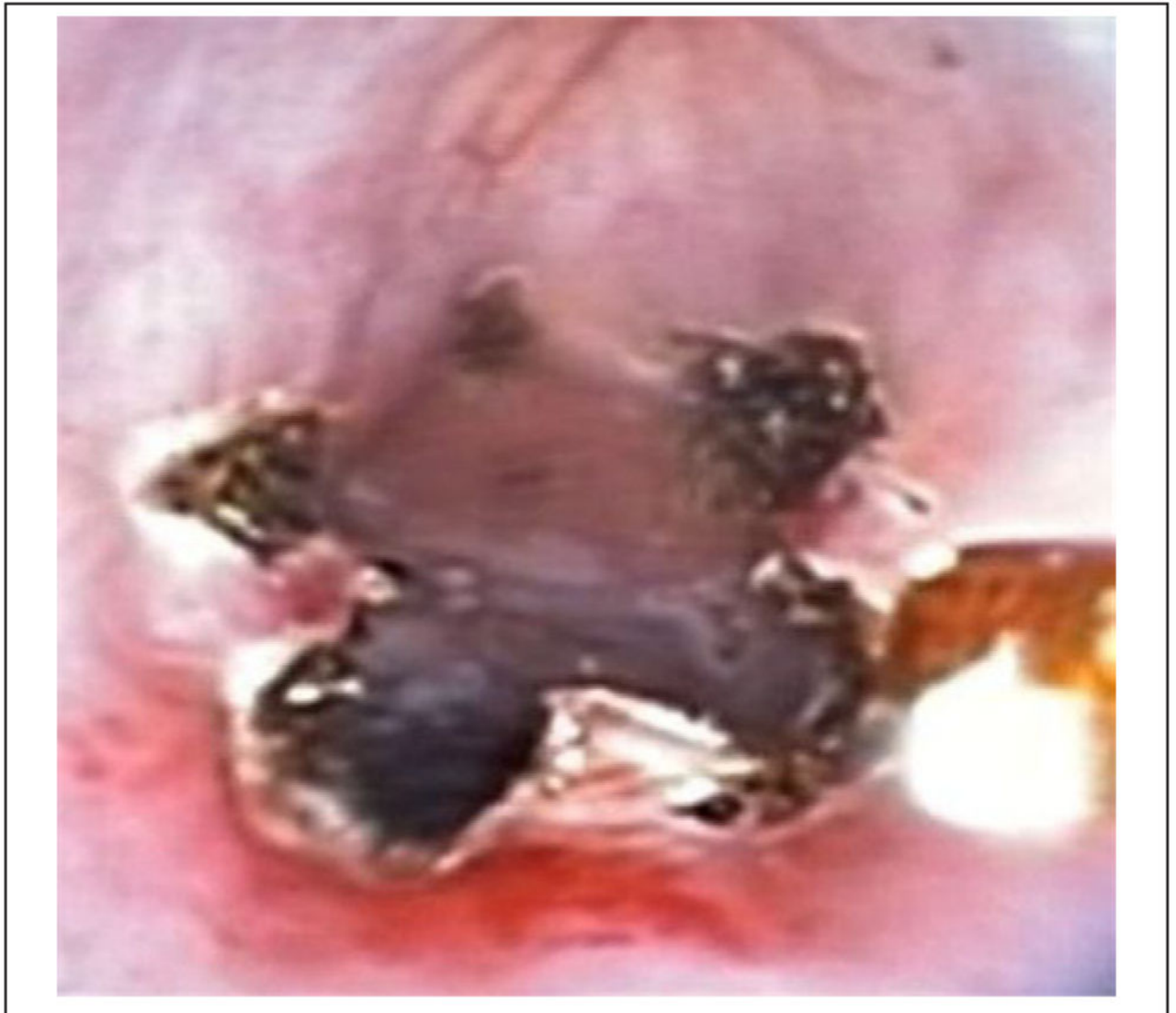
Figure 2. Idiopathic subglottic stenosis viewed with the videobronchoscope passed through the laryngeal mask airway (LMA) at the completion of CO 2 laser radial incisions.