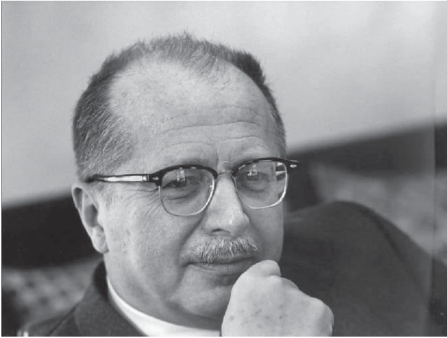
FIG. 1.—Photograph of Jesse Greenstein, taken in about 1966 by Leigh Wiener. It is reproduced with permission and courtesy of the Archives, California Institute of Technology.

of politics of extremism. From the Mann School, he carried away an abiding love of good, contemporary literature and the ability to read Latin.