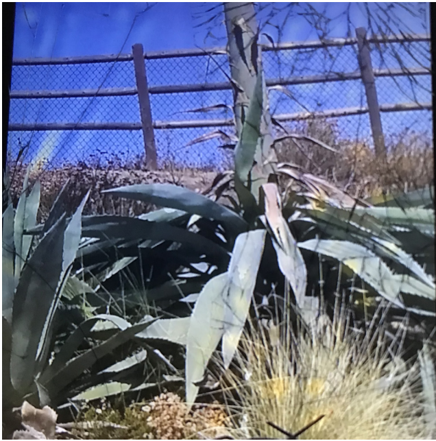
Image 1. Photograph taken by patient of agave plant.