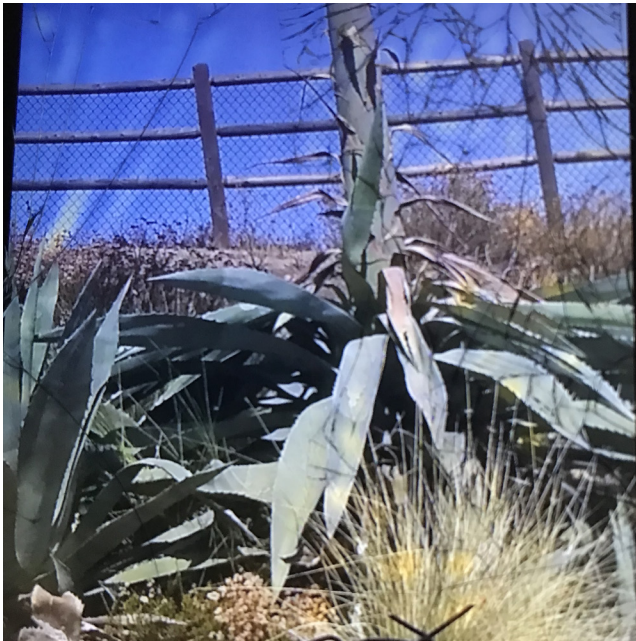
Image 1. Photograph taken by patient of agave plant.