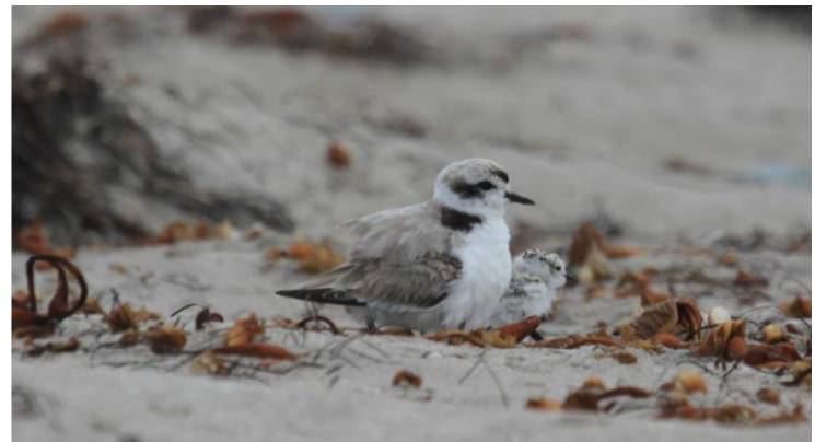
Western Snowy Plover

We would like to thank the Snowy Plover Docents for all of their hard work throughout the year. The plovers face a host of natural threats on the beach. By giving them space to feed and nest peacefully, we reduce the challenges that they must face on a daily basis.