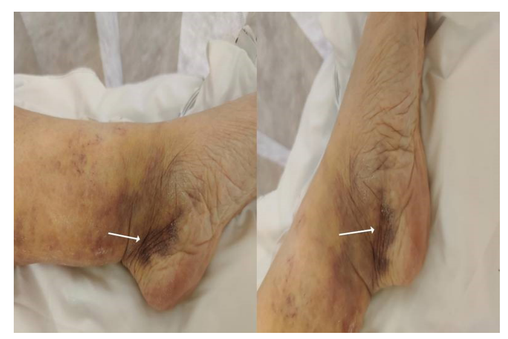
Figure 1 An extended photo of the left medial malleolus with the crescent sign (white arrows)