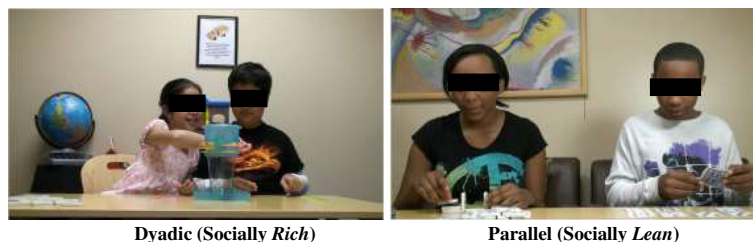
Fig. 1 Representative stimuli from interactive visual exploration task

Analyses were completed in R [47]. Linear models (LM) or linear mixed models (LMM) assessed simple between-group (ASD/TD, male/female) effects on basic attention (see “Preliminary Analyses”, below). Random effects of participant ID (intercept) were included to account for repeated measures (e.g., comparing gaze in dyadic vs. parallel conditions). Cohen's d is reported as a measure of effect size for linear models [48]. Following Cohen [48], d values between 0.20 and 0.50 reflect a small effect, between .50 and .80 a medium effect, and > 0.80 a large effect [6]. To account for individual differences in basic attention to the task (see “Preliminary Analyses”, below), raw gaze to faces was analyzed using generalized linear mixed-effects models (GLMM). In GLMM, gaze to the face was coded as a “hit,” while gaze to the rest of the screen (within condition) is coded as a “miss.” This solution allowed us to examine gaze to face AOIs relative to each individual's total attention to the screen (rounded to the nearest second), answering the question of relative gaze distribution (preference) while controlling for basic