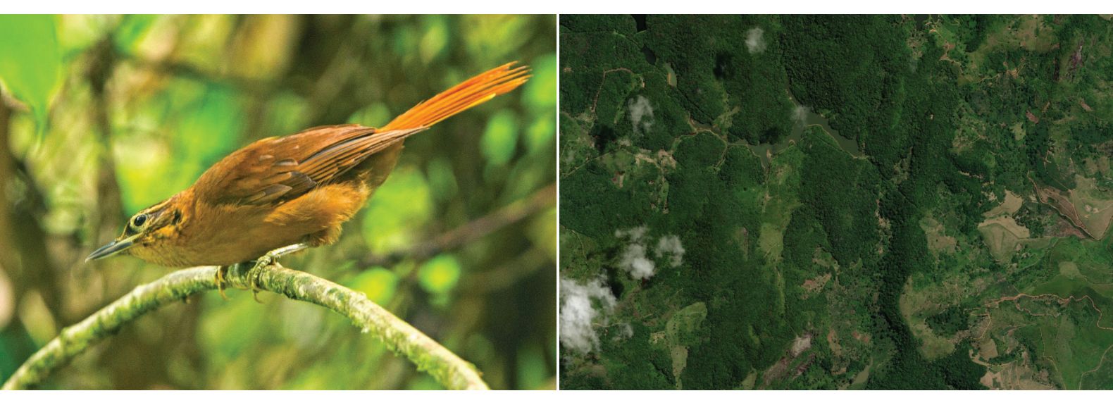
Left: Alagoas foliage-gleaner bird ( Philydor novaesi), extinct since 2011, due to deforestation. Right: Reserva Particular do Patrimônio Natural Frei Caneca (middle), its final habitat, and agricultural land (right), Pernambuco, Brazil.