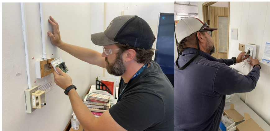
Figure 6. Images of ICs installing networked thermostats.

3. Due to a high number of interacting components and slow dynamics, the commissioning processes for HVAC controls is long and tedious. In all of the observations we conducted, configuration of thermostats, especially the ones that provided additional capability (i.e., demand-controlled ventilation or occupancy sensors) took the longest time. To address these issues, a simplified and clear commissioning process can reduce the time and effort required to configure and commission new devices. Images in Figure 6 show ICs inspecting thermostat wiring.