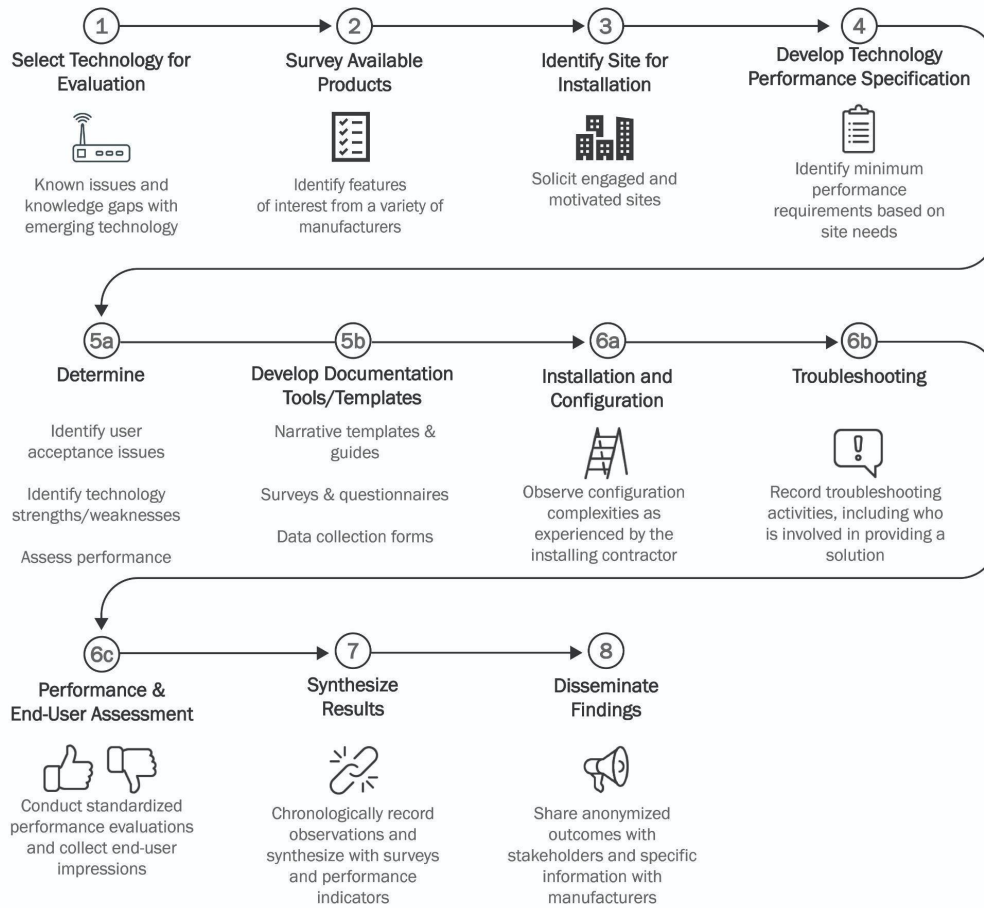
Figure 1. Research methodology overview.

(2021). An overview of the methodology as applied to RTU controls for the current study is provided in Figure 1.