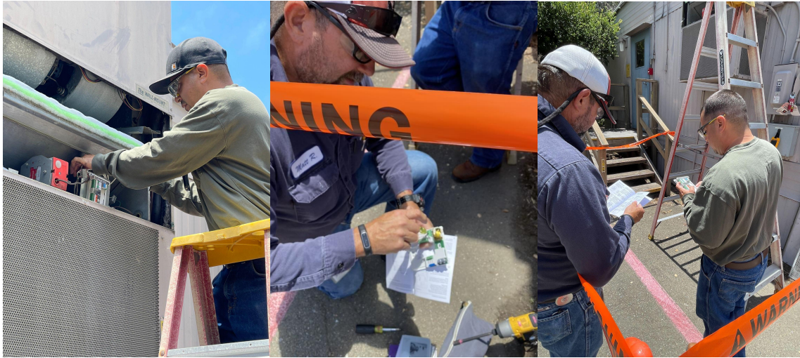
Figure 4. Images of the installation and troubleshooting process at LBNL.