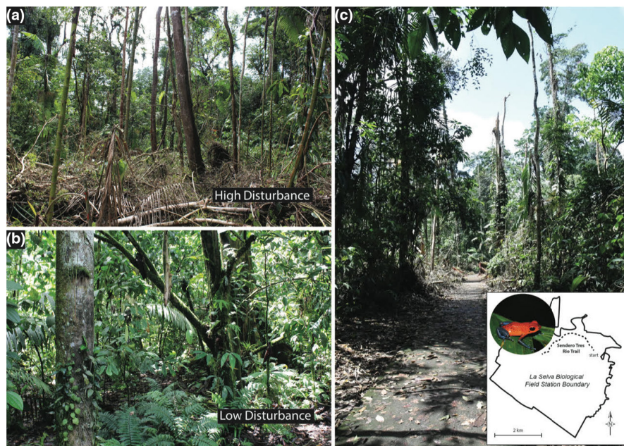
FIGURE 1 The impact of a novel extreme disturbance at a tropical field station. Photos show the impacts of a novel windstorm along study transects that we characterized as (a) high or (b) low- disturbance. (c) A map of the location of the study site at La Selva Biological Station (Heredia Province, Costa Rica, 10.43, -84.00) shows the focal species and main trail where transects were performed. Note that low-disturbance areas are representative of the typical habitat that our focal species, the strawberry poison frog ( Oophaga pumilio ), inhabits

While various species traits across taxonomic groups could be of relevant interest following this storm, we focus here on the change to UV-B conditions due to the biological relevance of ultraviolet radiation to our study species. In this study we quantified UV-B exposure in the disturbed habitat and evaluated whether increases in UV-B as a result of opened light gaps affected O. pumilio perch selection behavior. Ultraviolet radiation is known to negatively impact amphibian species through a range of lethal and sub-lethal effects across life stages. For example, in developing amphibians, UV-B exposure reduces amphibian larval survival, growth, locomotor performance, and induces developmental abnormalities. Malformations during development have been shown to alter behavior later in life, especially predator escape behaviors, which may have long-term consequences for fitness and population recruitment (Alton & Franklin, 2017). Adult amphibians exposed to increased ultraviolet radiation have been observed to suffer increased skin damage and mortality, and may experience the physiological costs of DNA repair in response to UV-B damage (Londero et al., 2019; Zavanella & Losa, 1981). Coupled with other stressors such as contaminants, pathogens, or environmental destruction, the effects of UV-B exposure on amphibians may be magnified (Blaustein & Kiesecker, 2002).