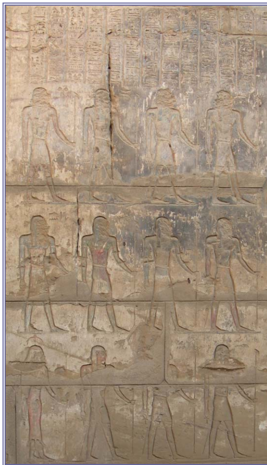
Figure 2. Twelve primordial deities at the temple of Khons, Karnak.

Equally elaborate cosmogonical systems were redacted, largely from preexisting text traditions, at the other major sacred sites of Upper Egypt during the time of the Ptolemies. These generally depict the local cult center as the point of first origin, the temple structure mythologically encapsulating the primeval mound of the earth. At Edfu, texts describe an island of sand, covered with a thicket of reeds, in the waters of chaos. Upon this island gather an assembly of Shebtiiu creator-deities who have emerged from the surrounding waters; in their presence there appears a slip of reed, which forms a perch ( djeba ) upon which the original falcon-god comes to rest. This becomes the “seat of the first occasion” of the god. Thereupon follows the emergence of mythical sacred districts associated with the temple of Edfu, along