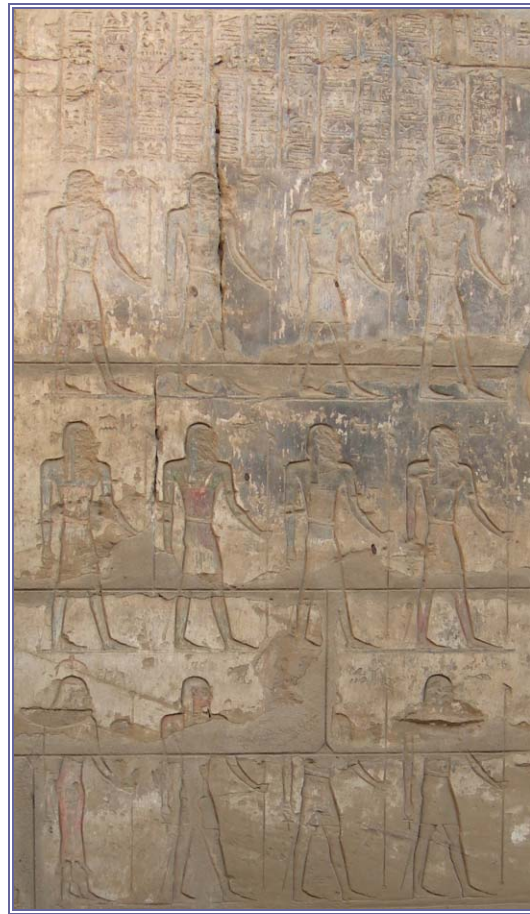
Figure 2. Twelve primordial deities at the temple of Khons, Karnak.

Equally elaborate cosmogonical systems were redacted, largely from preexisting text traditions, at the other major sacred sites of Upper Egypt during the time of the Ptolemies. These generally depict the local cult center as the point of first origin, the temple structure mythologically encapsulating the primeval mound of the earth. At Edfu, texts describe an island of sand, covered with a thicket of reeds, in the waters of chaos. Upon this island gather an assembly of Shebtii creator-deities who have emerged from the surrounding waters; in their presence there appears a slip of reed, which forms a perch ( djebe ) upon which the original falcon-god comes to rest. This becomes the “seat of the first occasion” of the god. Thereupon follows the emergence of mythical sacred districts associated with the temple of Edfu, along