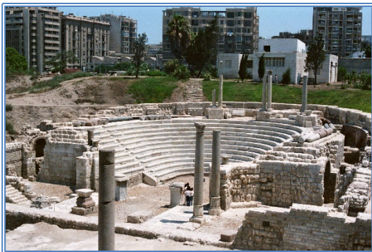
Figure 4. Kom el-Dikka.

Away from the Nile Valley, a number of late Roman archaeological sites can be found in the Fayum. Ongoing Italian excavations at Dimai, ancient Soknopaiou Nesos, have uncovered late Roman amphorae and Coptic texts. The University of Michigan excavations at Karanis (fig. 5) near modern Kom Aushim in the 1920s and 1930s, while still largely unpublished, produced extensive documentary evidence through the late fourth century CE and considerable material remains detailing daily life in late Roman Egypt. The possibility for coordinated study of these two bodies of evidence has produced calls for interdisciplinary approaches to the study of such sites (van Minnen 1994: 249), an approach taken recently by the University of California, Los Angeles (Barnard et al. 2015).