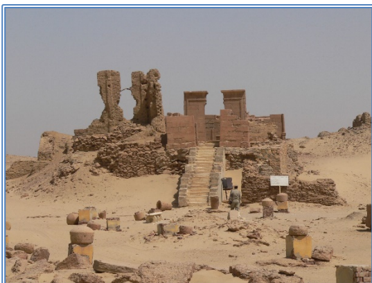
Figure 5. Karanis.

Away from the Nile Valley, a number of late Roman archaeological sites can be found in the Fayum. Ongoing Italian excavations at Dimai, ancient Soknopaiou Nesos, have uncovered late Roman amphorae and Coptic texts. The University of Michigan excavations at Karanis (fig. 5) near modern Kom Aushim in the 1920s and 1930s, while still largely unpublished, produced extensive documentary evidence through the late fourth century CE and considerable material remains detailing daily life in late Roman Egypt. The possibility for coordinated study of these two bodies of evidence has produced calls for interdisciplinary approaches to the study of such sites (van Minnen 1994: 249), an approach taken recently by the University of California, Los Angeles (Barnard et al. 2015).