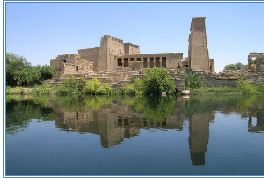
Figure 2. View of the Temple of Isis at Philae.

In only a few exceptional cases do we see traditional Egyptian religious sites continue to thrive. The temple of Isis at Philae (fig. 2) was important for the religious practices of people south of the Egyptian border, and the Isis festival survived there into the fifth century CE, with Nubian priests preserving ancient Egyptian traditions (Cruz-Urbe 2010: 503-504). Philae itself is the site of the last known inscription in hieroglyphs, from the reign of Theodosius I in 394 CE, and the site of the last known appearance of Egyptian in Demotic script, from the reign of Marcian in 452 CE. Recent scholarship has challenged the notion that Philae's Isis temple faced a dramatic closure in 537 CE under the orders of the emperor Justinian. It seems more likely that no such definitive break took place, and that indigenous religion at Egypt's southern border gradually assimilated into the Christian world (Dijkstra 2008: 340-344).