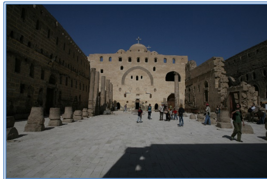
Figure 1. The White Monastery of Shenoute.

This adaptation of the Greek alphabet as a vehicle for writing the latest stages of the indigenous Egyptian language has its origins in the early Roman Period. However, it is not until the late Roman Period that we see a true flowering of Coptic literature. In the fourth and fifth centuries we see translations from Greek into Coptic of some Christian patristic literature. The best known source of activity for Coptic literature in this period was the White Monastery of Shenoute (fig. 1). Shenoute himself wrote actively from the 380s to the 460s CE. His sermons and letters make him a founder of Coptic literature (Emmel 2010: 90-92). In his work we find vivid denunciations of stalwart pagans still stubbornly practicing ancestral rites, and also of rich landowners whose corrupt lifestyles thrive on the backs of the rural poor (Behlmer 1993: 11-14).